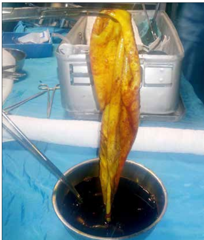
FIG. 3. Typical appearance of the germinative membrane of a hydatid cyst.

rate is 2%–25% and mortality rate is 0.5%–4% (1, 4). We preferred deroofing and omentoplasty because of the condition of the patient. Anthelmintic medications should be postoperatively administered even after discharge.