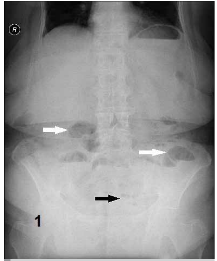
FIGURE 1. The white arrow in the directed graph indicates the findings of intestinal obstruction (free air-liquid levels), and the black arrow indicates air on the intestinal wall due to PCI.