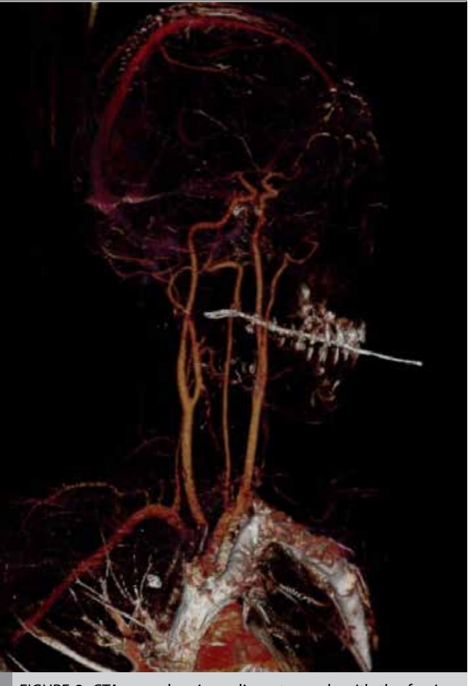
FIGURE 3. CTA scan showing adjacent vessels with the foreign body.

Vascular surgery and anesthesia consultations were obtained, and a decision was made for exploratory surgery. Two units each of erythrocyte suspensions and fresh frozen plasma were administered be-