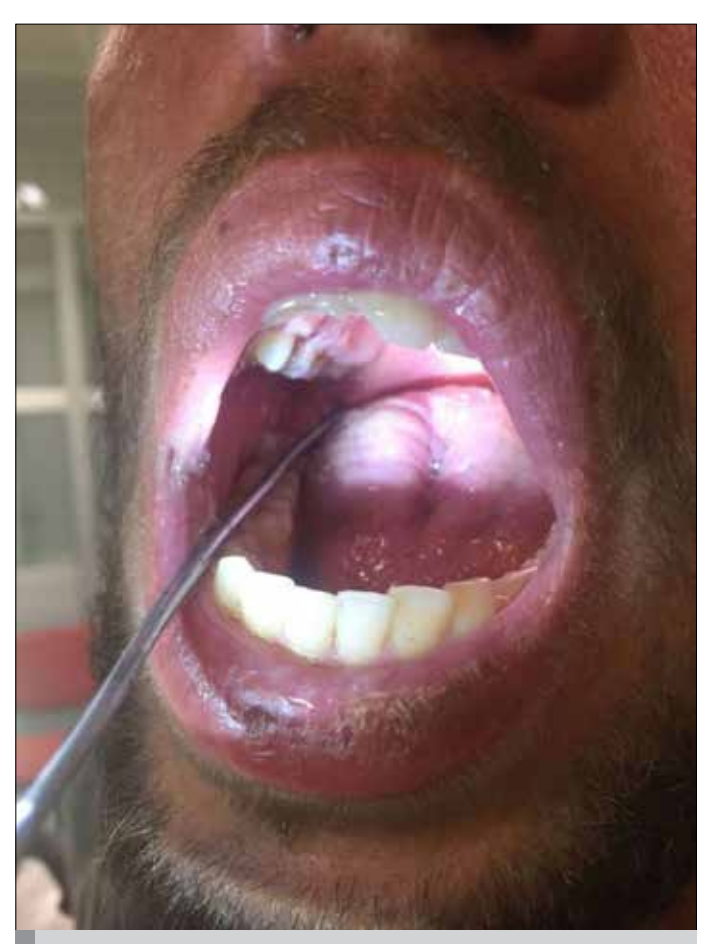
FIGURE 1. Impalement of iron wire.