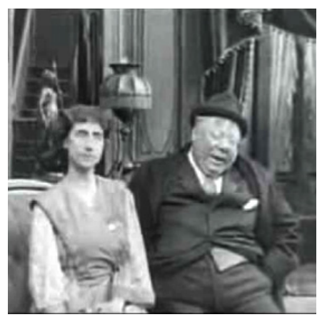
A Cure for Pokeritis (1912) Director: Laurence Trimble

In Hot Water , an "uncomforting" old woman attempts to sit in the front seat of the car instead of the back seat, creating a lot of problems for the male protagonist. Her scarf blocks the vision of the driver, and she plays with the steering wheel and pushes a button, leading the car to accelerate and crash into another car. This accident is the beginning of a series of more severe accidents involving the male protagonist. The old women are disturbing subjects for the childish male protagonist in these films from one of the great actors of silent motion pictures.