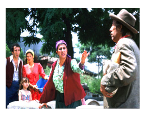
Gırgıriye (19281) Director: Kartal Tibet

of the 1980's, which depicted the people of Istanbul's district of Sulukule, Sabahat (Perran Kutman), the mother of Güllüye (Gülşen Bubikoğlu), is one of the funny obstacles for the male protagonist, Bayram (Müjdat Gezen). All the women, except those who show affection towards the male protagonist, are ridiculized in these films.