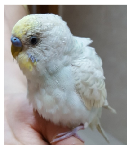
Figure 1. Anxious appearance of the budgerigar

baking ingredients (such as particles of chocolate, cocoa powder), and cocoa bean mulches (5). Likewise, in this case report, a budgerigar ate a cake containing chocolate and also sugar covered with chocolate, thus, had intoxication symptoms. Studies about toxic effects of methylxantines in birds could not be cited. But, this kind of components known to antagonize adenosine receptors in mammalians (3,13,15,18). Although adenosine receptors present in whole body, methylxantines mostly effect receptors present in the nervous system and cardiovascular tissue. In cardiovascular system, antagonising effects of these receptors were end up with tachycardia, hypertension and ventricular arrhythmia in the ECG (3,8,9,18).