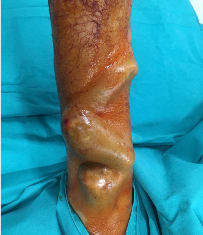
Figure 1. Preoperative massive aneurysmal arteriovenous fistula (AVF).