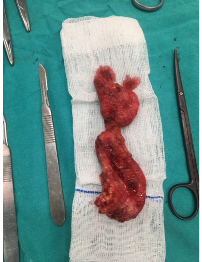
Figure 3. Circumferential dissection of a venous aneurysm (VA).