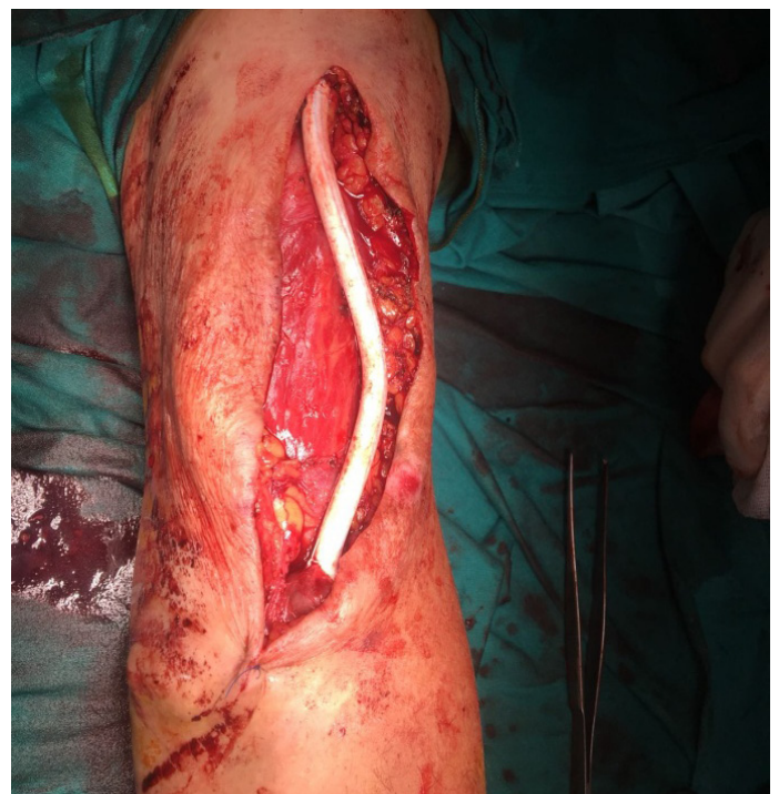
Figure 4. End-to-end anastomosis was performed between the proximal and distal portion of the AVF with 6 mm of Acuseal vascular graft.