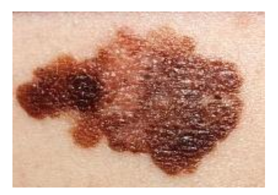
Fig. 1. A general pattern of Malignant Melanoma

Melanoma is generally the most serious form of skin cancer. It tends to trigger genetic defects causing skin cells to proliferate and form malignant tumors when unrepaired Deoxyriba Nucleic Acid (DNA) damage occurs. These tumors are caused by pigment-producing melanocytes in the basal layer of the epidermis. When cancer begins to change and starts to grow, healthy cells form a mass called tumor and are out of control (Fig1). In general, about 8% of those diagnosed with new Melanoma have first-degree relatives with Melanoma. In a much smaller percentage of 1% to 2%, there are two or more close relatives having Melanoma.