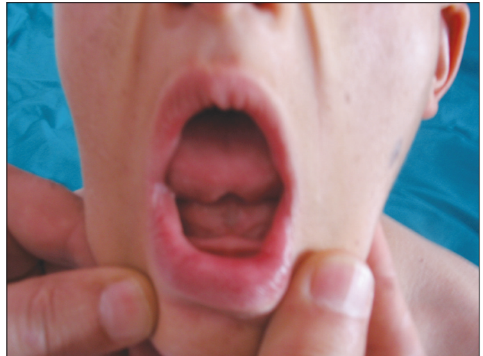
Figure 2: Congenital anodontia.

Correspondence Address / Yazışma Adresi: