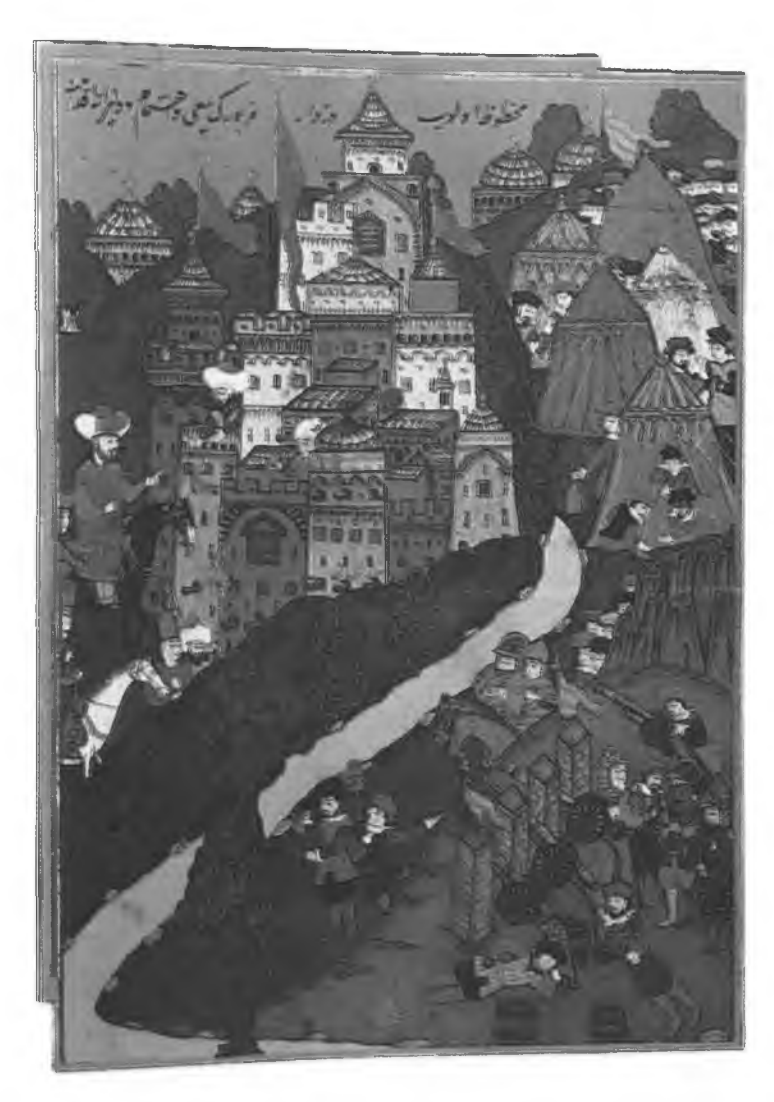
Fig. 1 – The Battle of Nicopolis. 1396. Miniature. Istanbul Topkapı Palace. Inv. No. H. 1523. Page: 108 b.