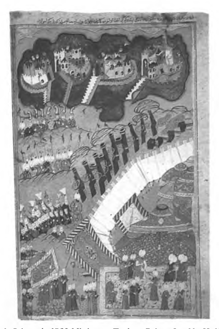
Fig. 7 The Castle Szigetvár. 1566. Miniature. Topkapı Palace. Inv. No. H. 1524. Page: 279 b.