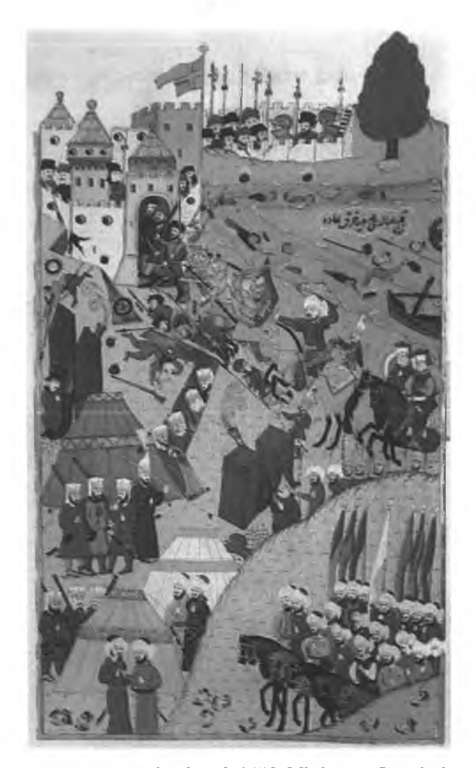
Fig. 2 – Battle of Belgrad. 1456. Miniature. Istanbul Topkapı Palace. Inv. No. 1523. Page: 165 a.