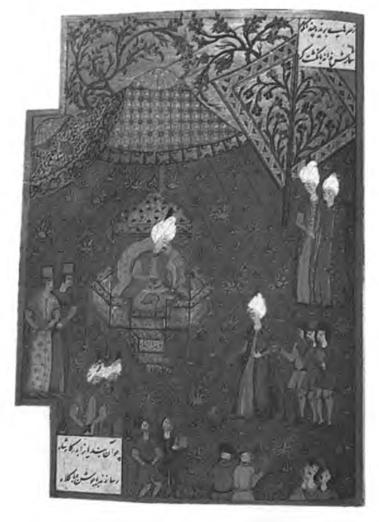
Fig. 4 – Suleyman I. 1529. Topkapı Palace. Inv. No. H. 1517. Page: 297 a.