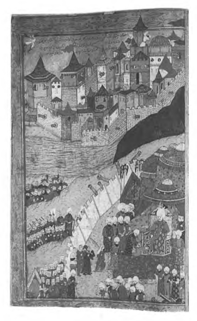
Fig. 6 – Suleyman I. in Buda Castle. 1541. Miniature. Topkapı Palace. Inv. No. H. 1524. Page: 266 a...