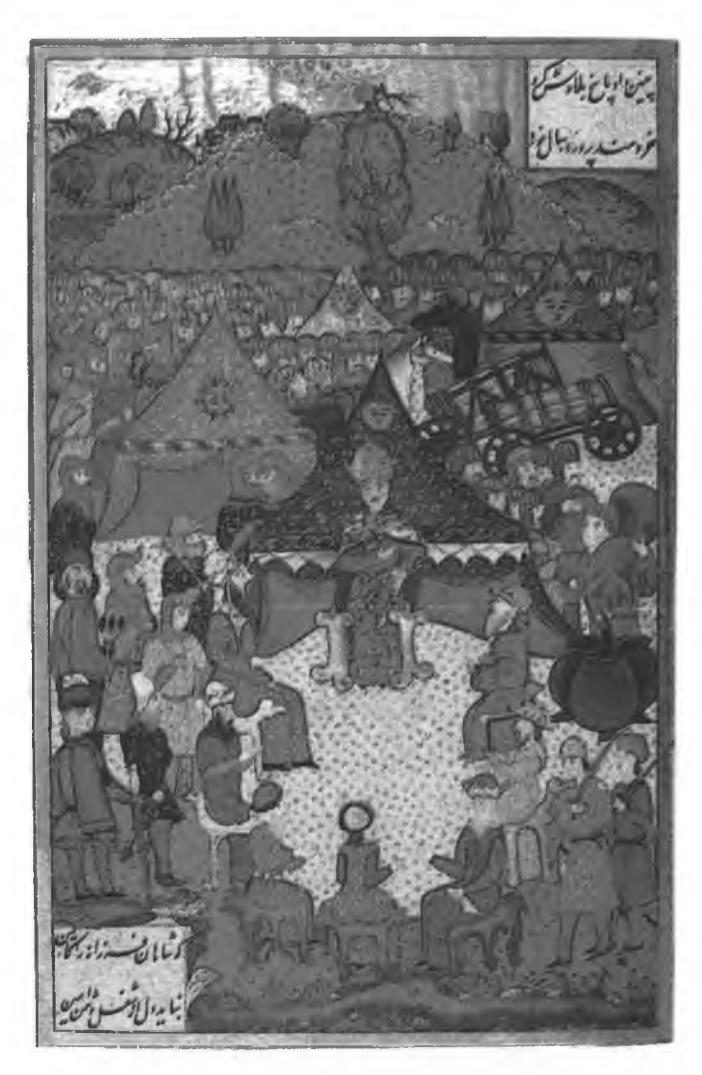
Fig. 3 – The King Lajos II. with his war-councel, in 1526. Miniature. Istanbul Topkapı Palace. Inv. No. H. 1517. Page: 200 a.