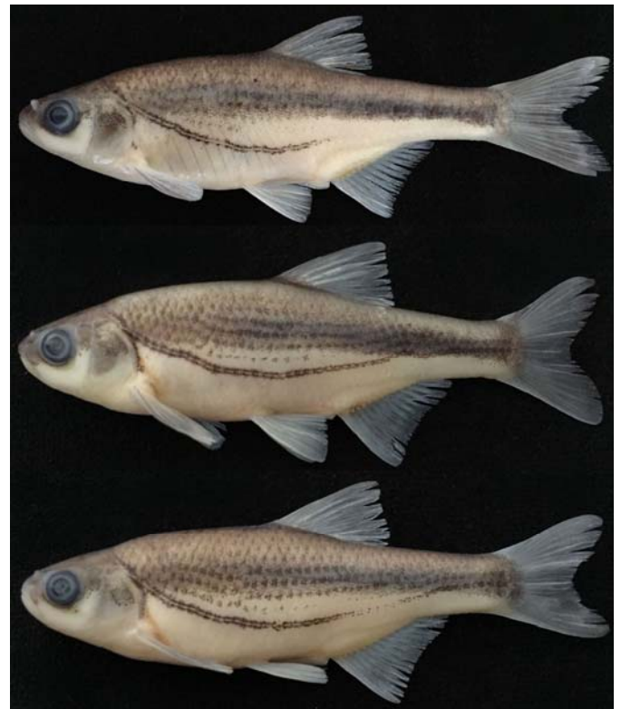
Figure 1. Alburnoides kosswigi , FFR 07008, from the top, 78 mm SL; 60 mm SL; 55 mm SL; Turkey: stream Beykonak.

Morphological investigation of the Alburnoides kosswigi populations from Lake Ilgın and Sakarya revealed no morphological differences except by having less scale rows between lateral line and anal-fin origin (3–4 in Lake Ilgın populations, vs. 4–5 in Sakarya populations), less total vertebrae (38–39, vs. 39–42) and less predorsal vertebrae (11–12, vs. 13–14).