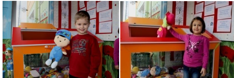
Figure 3. The toy box

In order to increase awareness and to ensure interest and support for the project, toy boxes upon which the project explanation was written, were on display in front of each preschool educational institutions for a period of 15 days, and brochures were distributed in order to attract donations of toys.