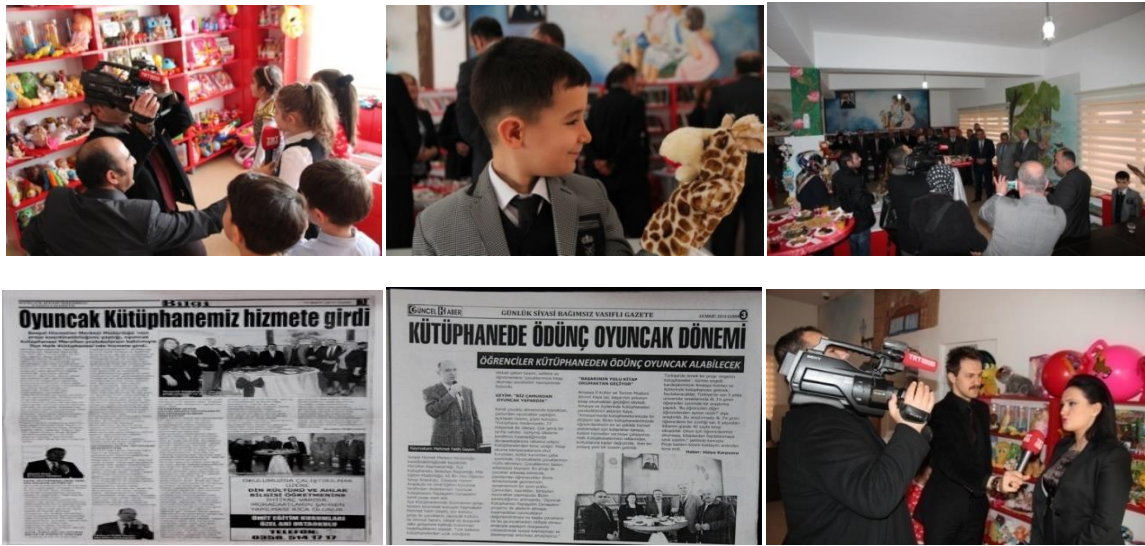
Figure 5. The opening ceremony

The purpose of the project and its function was announced to the public with an official opening ceremony held on March 13, 2014 with the participation of management from the official institutions, representatives of the NGOs, and the press.