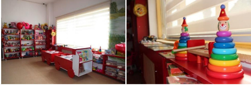
Figure 4. Preparation of the application area

Association, etc.). The toy libraries require not only premises, but the employment of continuous staff, which may give rise to problems over time in terms of the sustainability of the project. Since the project is similar to a book library in terms of its purpose and function, and since libraries are no foreigners to the lending process, situating the toys library under responsibility of the Merzifon Public County Library ensured financial ease, sustainability and support for the project. Accordingly, a section of the library was re-organized as the toys library.