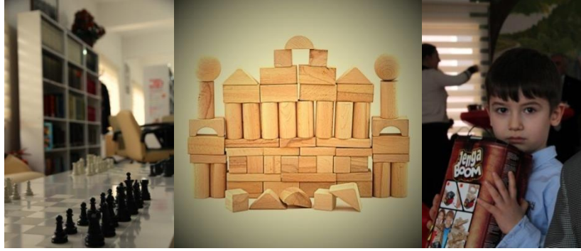
Figure 1. Determination of the toys

In order to determine which toys would be used in the study, a council was formed consisting of preschool and primary school teachers, under leadership of the teachers from the project team who represented the National Education Management. The council was given the duty of determining which toys were suitable for preschool and primary school level children by considering children's developmental characteristics. Classifications of toys were made based on the viewpoints of the preschool and class teachers. Recommendations found in the literature on the properties of the toys were noted such as the toys being plain, durable, handy, easy-to-repair, cleanable, proper for the developmental stages and different developmental areas of children, and having qualities that could stir interest in the children in terms of audio and cognitive properties. In addition, toys were discounted where they could be considered to drive children towards aggressive behaviors (e.g., guns, rifles, etc.) and where they were produced of natural materials (Pehlivan, 2005). In addition, in selecting the toys, gender appropriateness was noted, as was toys that could be played with among peers to increase socialization. On this issue, preferences of those teachers who had children took precedence.