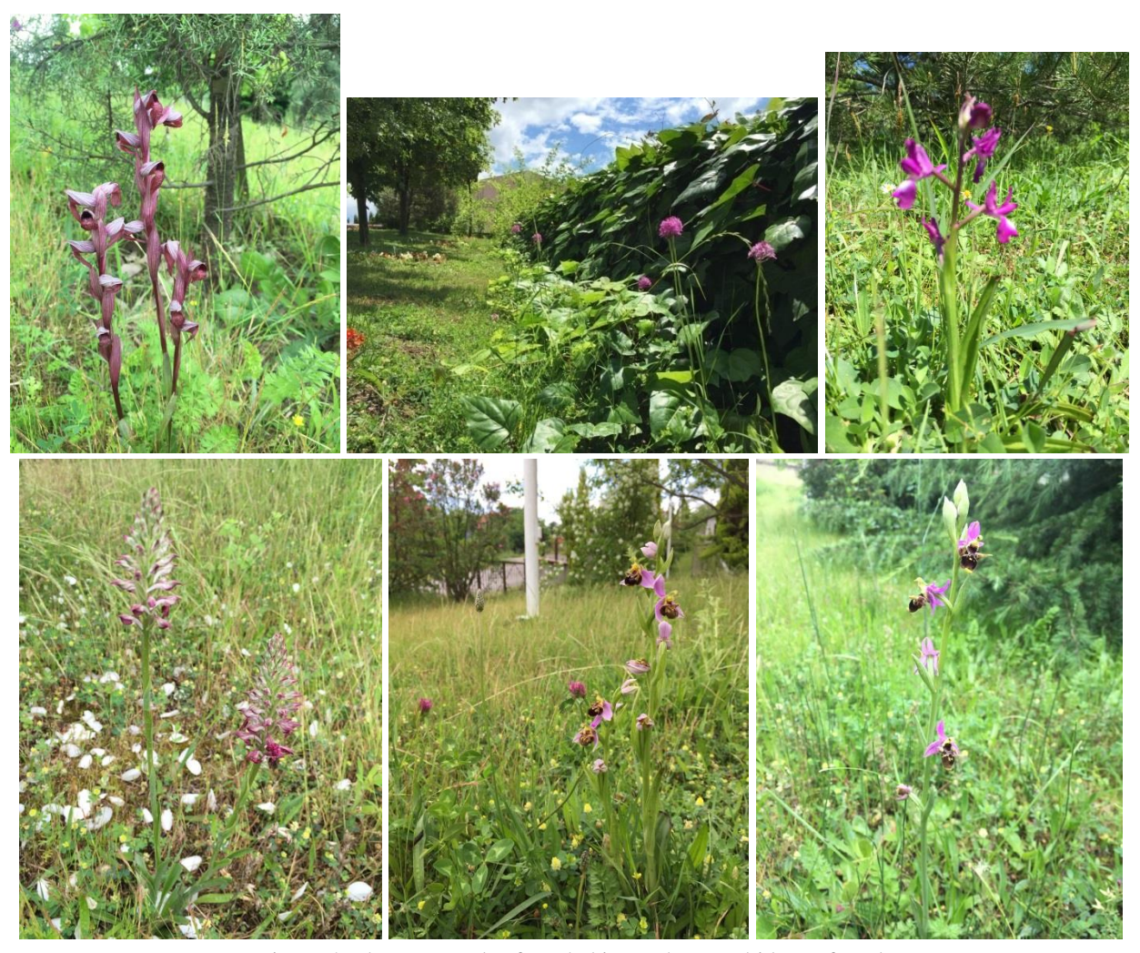
Figure 4. These examples from habitats where orchids are found.

Anacamptis pyramidalis (Pyramidal orchid) were found in the grassland close to campus wall borders and under climbers in particular the dense Hedera canariensis (Canary Island ivy), road edges, green borders, areas where lawns can not be mowed due to trees, shrubs, climbers and hedgerows in campus (Figure 4).