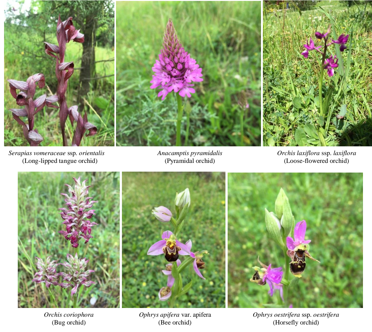
Figure 3. All orchid species were found in the Ağdacı Campus.

According to the literature of "Flora of Turkey and East Aegean Islands", the general habitat characteristics of the orchids found in the area are as follows (Davis, 1965-1985; Babaç, 2004; Bakış et al., 2011):