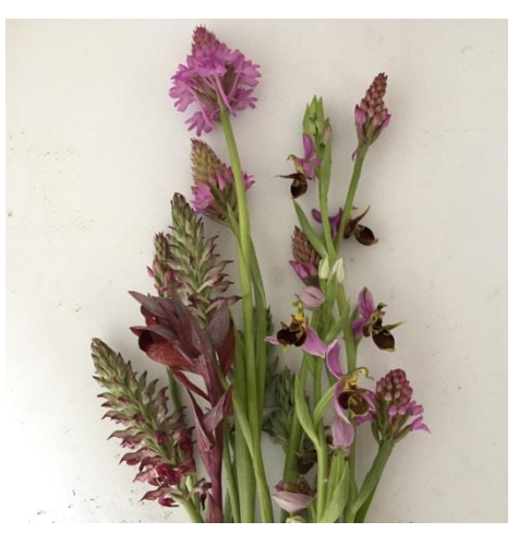
Figure 2. All orchid species were found in the Ağdacı Campus.