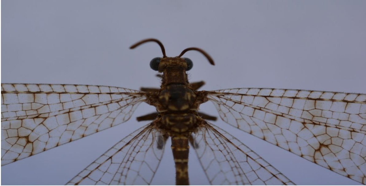
Figure 3. The coloration of the pronotum of E. platypterus .