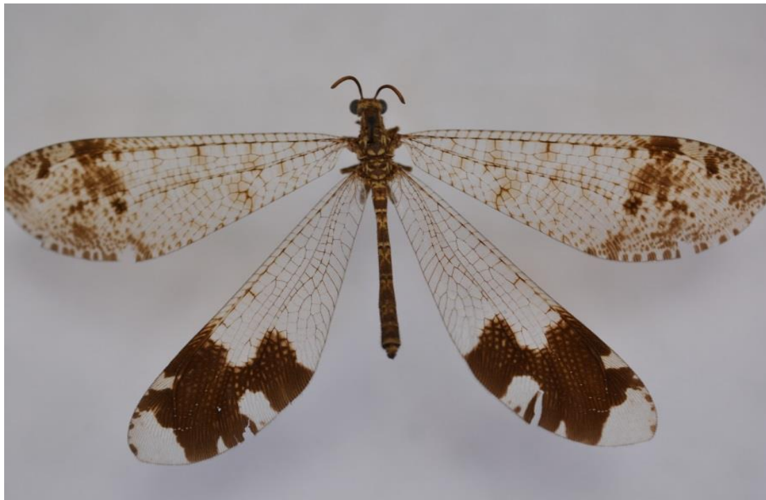
Figure 2. Wing-pattern of E. platypterus .