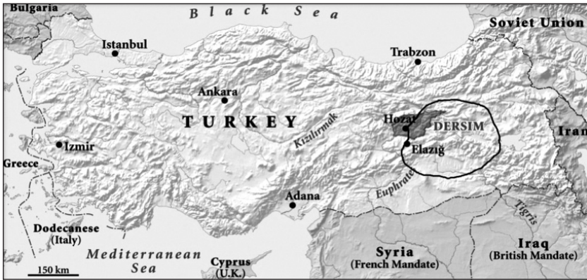
Approximate area encompassing the Sheikh Sa'id of Piran Rebellion