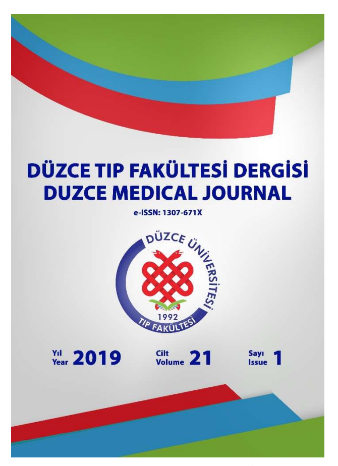
Figure 2. New cover of the journal since 19th volume

In addition, all processes such as author guidelines, writing rules, double-blinded peer-reviewed principles, and compliance of articles with scientific publication standards were checked, and updates and improvements were made if necessary. Author guidelines, writing rules and review process for an article are included in detail on the website.