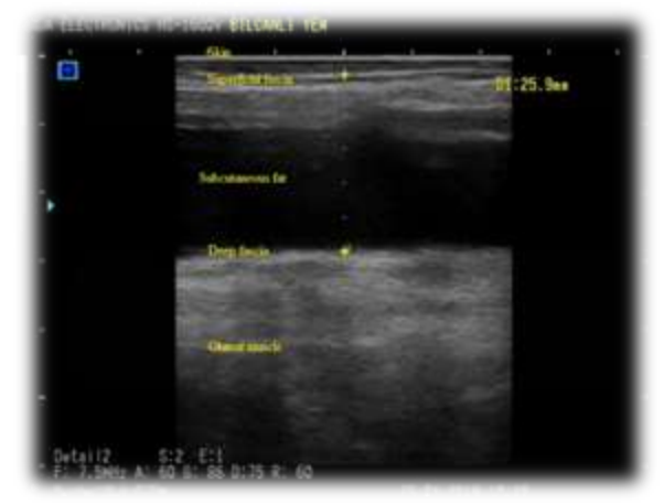
Figure 2. Transrectal ultrasonographic fat thickness (25.9 mm) in a Holstein-Friesian cow with BCS=3.25 (group 2) (57-months) on Postpartum Day 0–5 in the transition period

thicknesses measured as per transrectal ultrasound examination method are demonstrated according to literatures in Figure 2, 3.