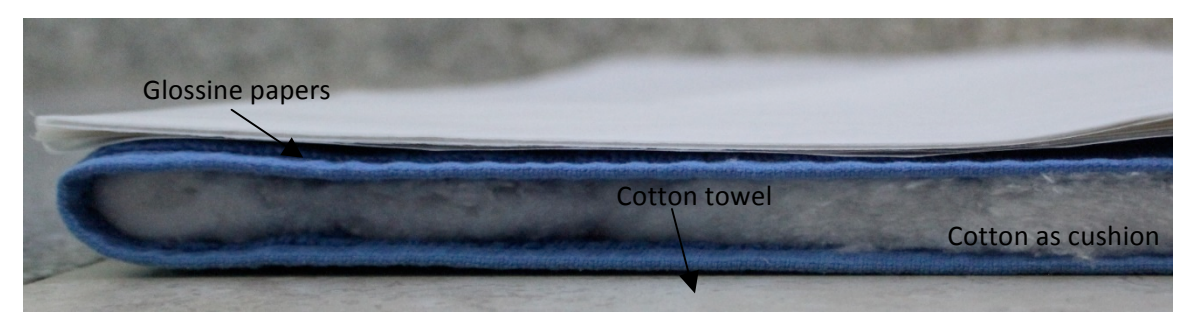
Figure 3: Details of the impact surface structure.

The impact surface is so important in experiment. If the PCB hit the ground hard surface directly, may be damaged or crashed. For this reason, the ground surface is covered with an energy adsorbent surface. This surface should be absorb most of kinetic energy during impact and minimize reflecting energy to PCB and minimized PCB shape deformation. To make this multilayer surface energy adsorbent and avoid surface sink, we used some layers of cotton as cushion and glossine papers as appropriate level. Figure 3 shows details of the designed surface. The thickness and details of each layer is given in table 2.