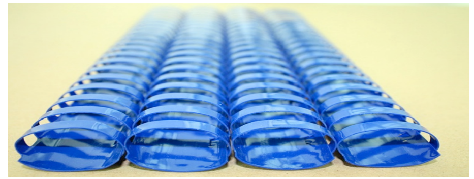
Figure 1. Typical samples of PCB used in experimental tests

To increase the accuracy and reduce the error, test is repeated 3 times with approximately similar material.