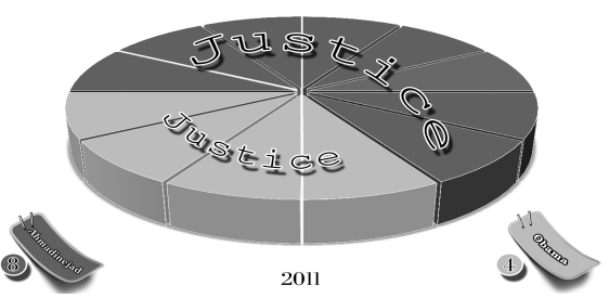
Table 2. The 66<sup>th</sup> united nation general assembly