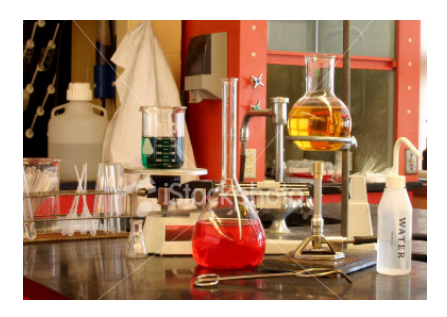
Figure 2: Legend for figure 2