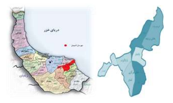
Figure 3. Location of Lahijan city in Gilan province.