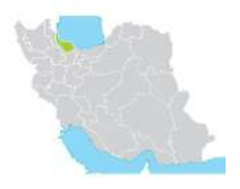
Figure 2. Geographical location of Gilan province in Iran.

The city is geographically located beside mountains with ever green tea bushes in organized order. The weather is humid and temperate with cold in mountains.