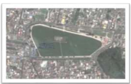
Figure 4. Location of pool against Lahijan's location.