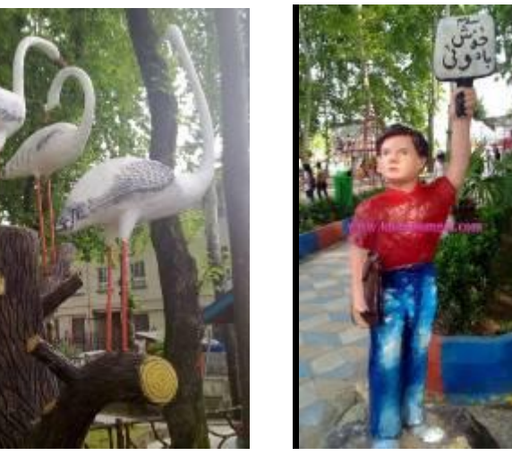
Figure 8-9-10. Rest of sculptures inside Fuman park, 2011.

5 .Sculpture of souvenir and costume at Fuman