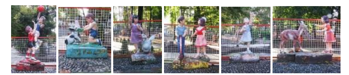
Figure 6. Children's sculptures during playing, 2011.