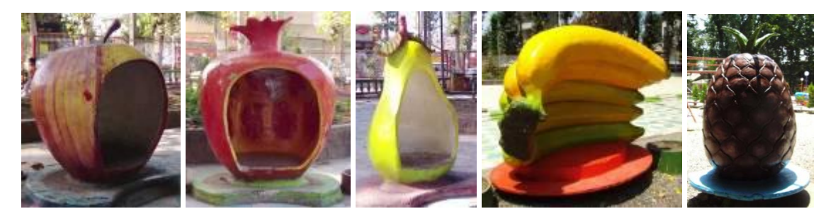
Figure 7 . Fruit sculptures inside the park, 2011.