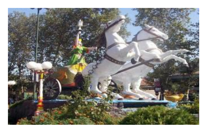
Figure 1. Anahita sculpture at the square of Fuman county, 2010.

1. Anahita sculpture in two parts of the world in Fuman County and Paris represents symbol of water and lightness in old culture of this city, rooted in people's old traditions and customs.