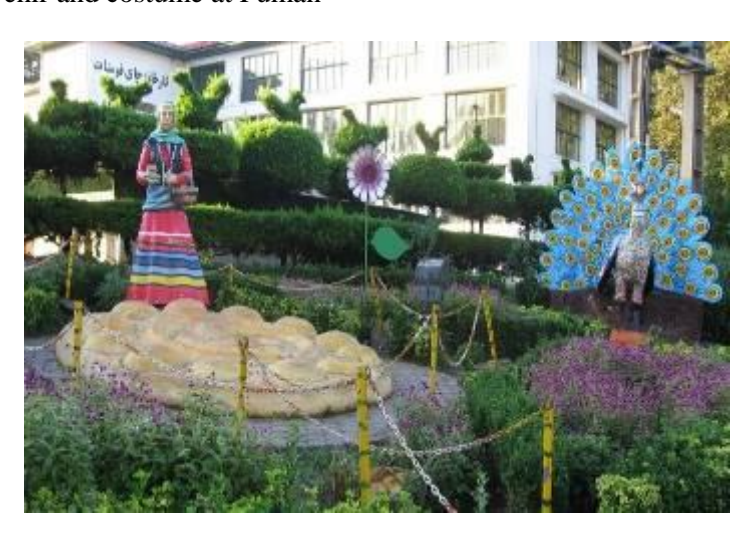
Figure 11. Sculpture of cookie and rural woman with costume, 2010.

5 .Sculpture of souvenir and costume at Fuman