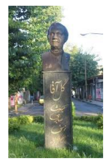
Figure 12. Shion sculpture, 2010.