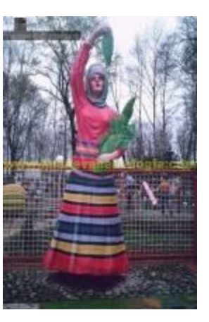
Figure 2. Chahar Dokhtaran sculptures in front of park, 2010.

3. Shekarbanan sculpture which represents symbol of hunting among people of this city especially in rural regions has been placed at the early Fuman road to Masooleh.