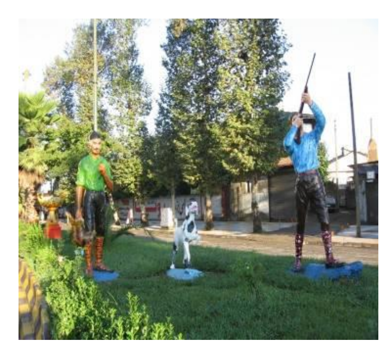
Figure 3. Shekarchian sculpture, Ayatolah Kashani blvd, 2010.

4. Happy children's sculptures inside the park represent people's happiness and local plays at this region. There are old sculptures in the façade across the park.