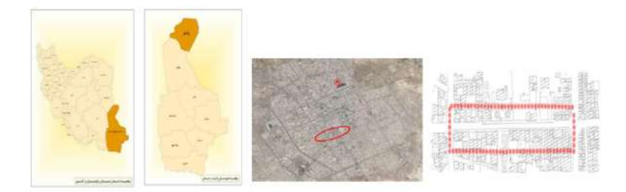
Figure 1. Determination of physical and functional aspects in Ferdosi Street.