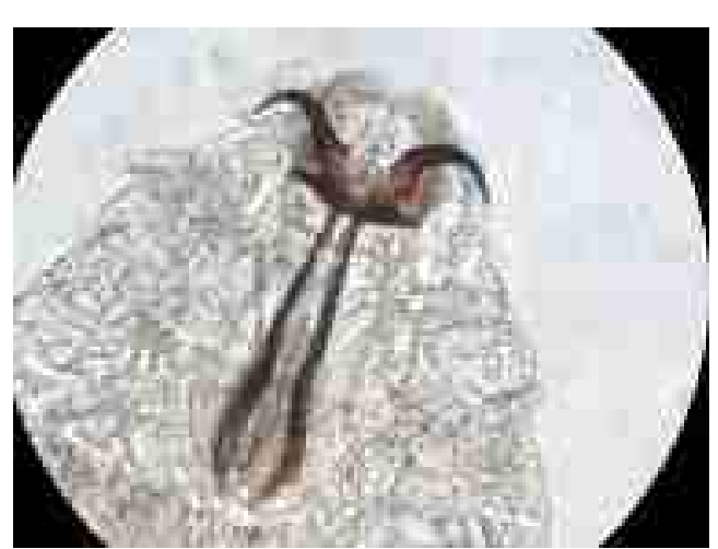
Figure 4. The hooks which are located on the head of the first term larva, help to hold on conjunctiva tightly.

In taxonomic classification ophthalmomyiasis flies are composed of three families; Oestridae, Calliphiride, Sarcophagidae [7]. Oestrus ovis fly which is the most frequent factor of human ophthalmomyiasis, after maturation it leaves its eggs to nasal mucosa of farm animals such as sheep, goat, cattle and horse. After larvae proceeding towards nasal cavity and frontal sinus and get matured, they drop into cocoon through nasal mucose (by sneezing). It completes its life cycle after coming out of its cacoon between three and six weeks. Human is a random interval in this cycle. The black image of papilla imitates a safe hole that myiasis fly can leave its larvae after ovulation. As a result of strike of myiasis fly to cornea, larvas fall into conjunctival fornix. Conjunctival sac as being wet, hot and dark area plays a role of ideal