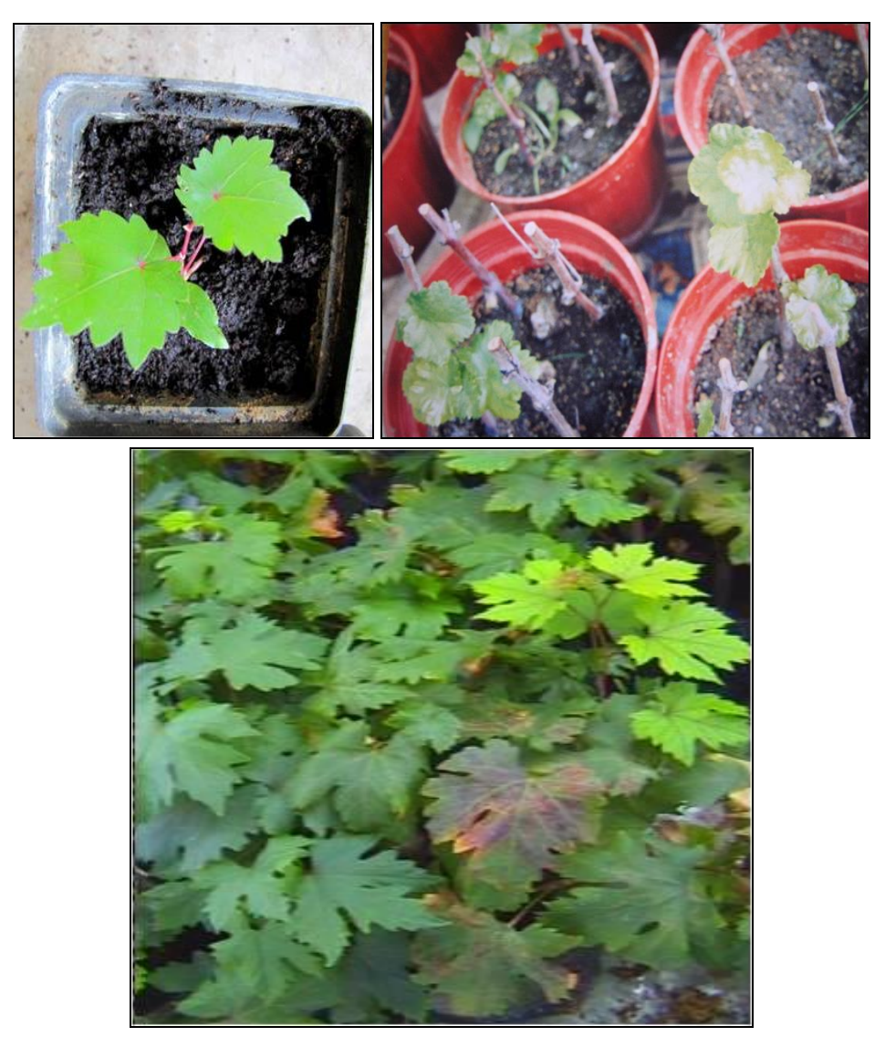
Figure 3. Producing of grapevine plants from seeds and rooting of cuttings taken from healthy and GLRV-infected plants.

The healthy plants were produced by cuttings and seeds of the same cultivar, and used in transmission experiments. P. citri cultures were maintained on the young shoots of germinated potato tubers (Figure 4). Field-collected gravid females of P. citri with ovisacs were transferred on sprouted potatoes and reared for several generations throughout the years at 25 \pm 1^{\circ} C, and 70 \pm 10\% R. H.