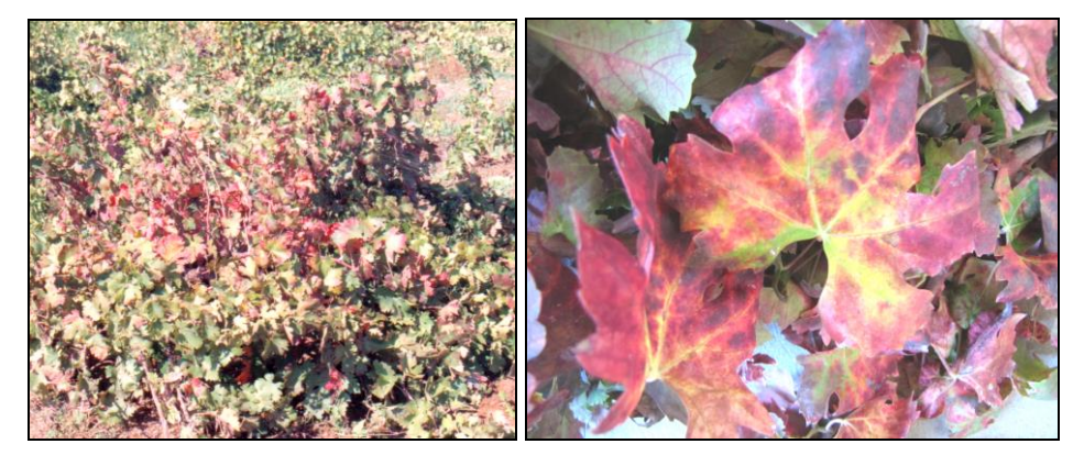
Figure 1. Typical symptoms of Grapevine leafroll disease: reddening of the lamina, interveinal discoloration and downward rolling of the leaf margins.

Plant and Insect Cultures: Grapevine plants ( Vitis vinifera L.) of cv. "Antep karası" was selected as the source of virus which were exhibited typical leaf symptoms of Grapevine leafroll disease (Figure 1) during the surveys in the vineyards of Hatay province. They have been identified to be infected with GLRaV-1 and GLRaV-3 by previous study conducted by Çağlayan (1997) using Double antibody sandwich-Enzyme linked immunosorbent assay (DAS-ELISA) and Transmission Electron Microscopy (TEM) technique during the years of 1997-2001 (Figure 2).