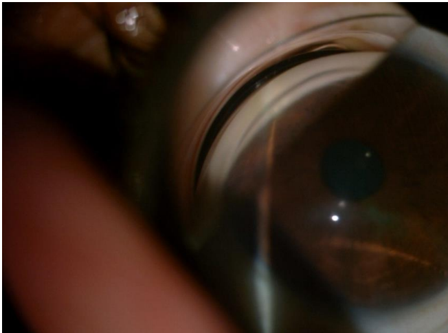
Figure 2: Iridocorneal angle in Stage 3 of the treatment process

The patient's pain decreased after intravenous infusion treatment with 1g/kg, 20% mannitol. Subsequently, intraocular pressures in the right and left eye decreased to 37 and 38 mmHg, respectively. Timolol maleate + dorzolamide gtt (Cosopt, Merck Sharp&Dohme) 2x1, brimonidine tartrate gtt (Alphagan P, Allergan) 2x1, cyclopentolat HCl gtt (Sikloplejin, Abdi İbrahim) 3x1, dexamethasone gtt (Maxidex, Alcon) 4x1, acetazolamide 250 mg tablet