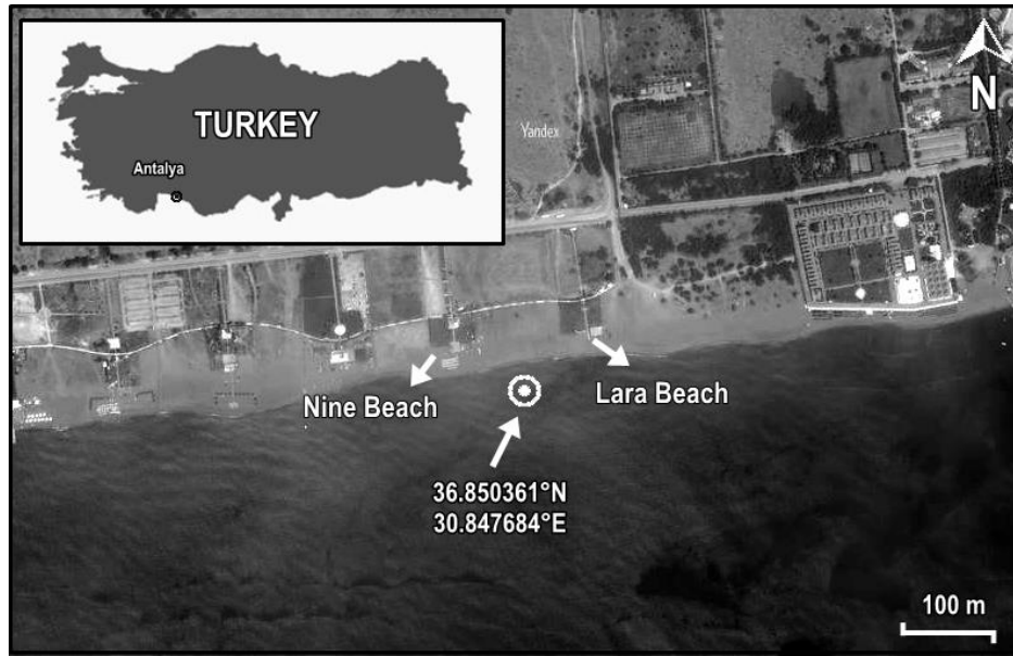
Fig. 1: Map of the study area showing the sampling station.