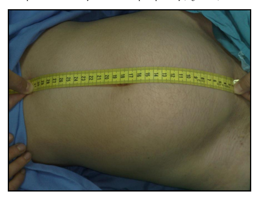
Figure 1. Right ovarian cyst filling the whole abdominal cavity.

abdominal cavity. We extirpated the cyst capsule as in open laparotomy (Figures 4-5).