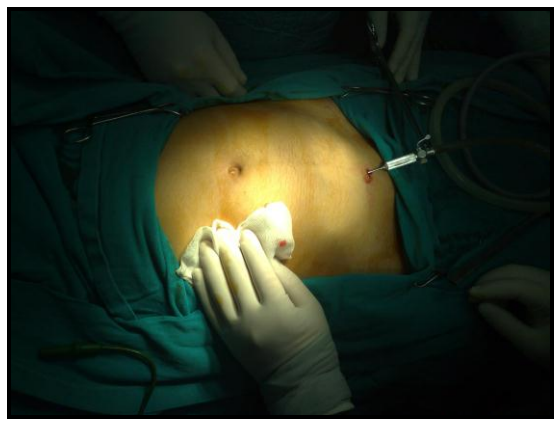
Figure 3. Insertion site of the Verres Needle connected to the aspirating device.

Pin-point coagulation was sufficient for haemostasis. The edges of the ovary tissue were approximated by four simple sutures and the right ovary was placed into its original site. The patient was discharged on the second day after the operation without any complications. The pathological diagnosis of mucinous cystadenoma confirmed the benign nature of the cyst.