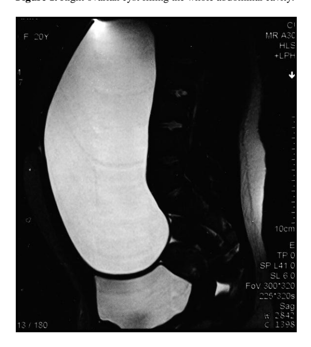
Figure 2. Magnetic resonance image of the cyst in sagittal section.