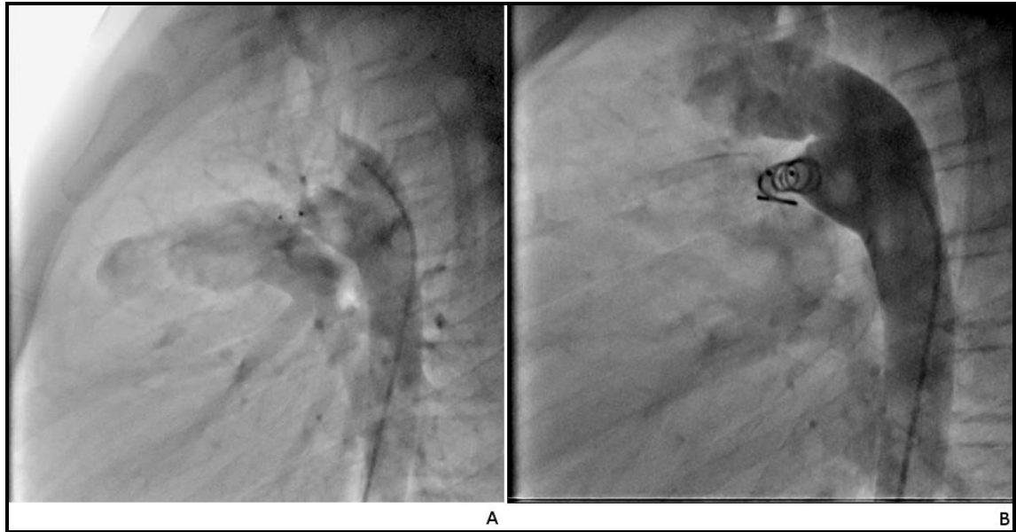
Figure 2. a) At the lateral view, Amplatzer duct occluder II is still in stable position, but there was a moderate residual patent ductus arteriosus leak at the distal of the device. b) Amplatzer duct occluder II embedded by a big Cook detachable coil like a sandwich.