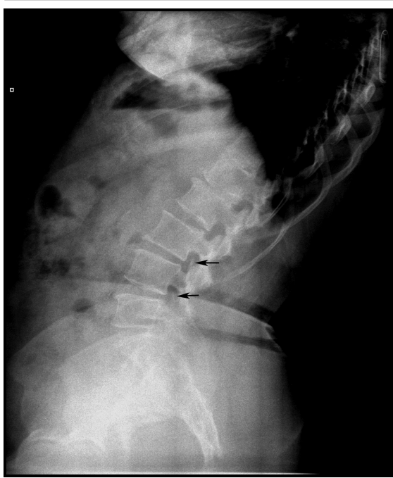
Figure 1. Radiography of the thoracolumbar spine showing linear opacities superposed over the L3-4 and L4-5 neural foramen (arrows).