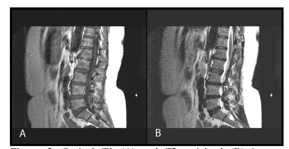
Figure 3. Sagittal T1 (A) and T2 weighted (B) images revealing linear heterogenous low signal lesions narrowing the spinal canal at L3 and L4 level in the region of the ligamentum flavum (arrows).

patient. The extent of spinal cord compression, underlying spinal cord injury and the compressive lesion can be demonstrated by MRI (8). Especially T2 and STIR sequences can easily demonstrate the spinal cord injury or myelopathy.