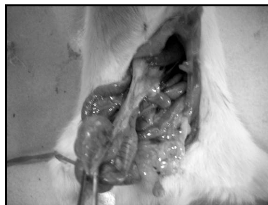
Figure 1. The view of adhesion formation from a Group 1 rat.

Adhesions occurred between the abdominal visceral organs and incision. The brushed caecum - ileum wall were mostly effected. In addition, there were also adhesions to incision among the omentum, small intestine and liver. Adhesion grades of the groups are presented in Table 2. According to ANOVA test, there were significant differences in adhesion grades between groups (p=0.034). There were no grades 3 and 4 adhesions within groups 2 and 3. In comparing adhesion grades, a significant difference was found between group 1 (Fig.1) and group 3 (Fig.2) (p=0.028). Similarly, a significant difference was found between group 1 and group 2 (p=0.049). Although adhesion formation scoring was higher in group 2 than group 3, the difference was non-significant (p>0.05). In addition, with Chi-square test performed between the group 2 and group 3, there was no statistical difference (p>0.05) by the means of scores of adhesion grades. Then the control group compared with group 2 and group 3 in the same manner, using Chi-Square test. There was statistically difference between the control group and other two groups (p<0.05).