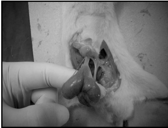
Figure 2. The view of adhesion formation from a group 3 rat.