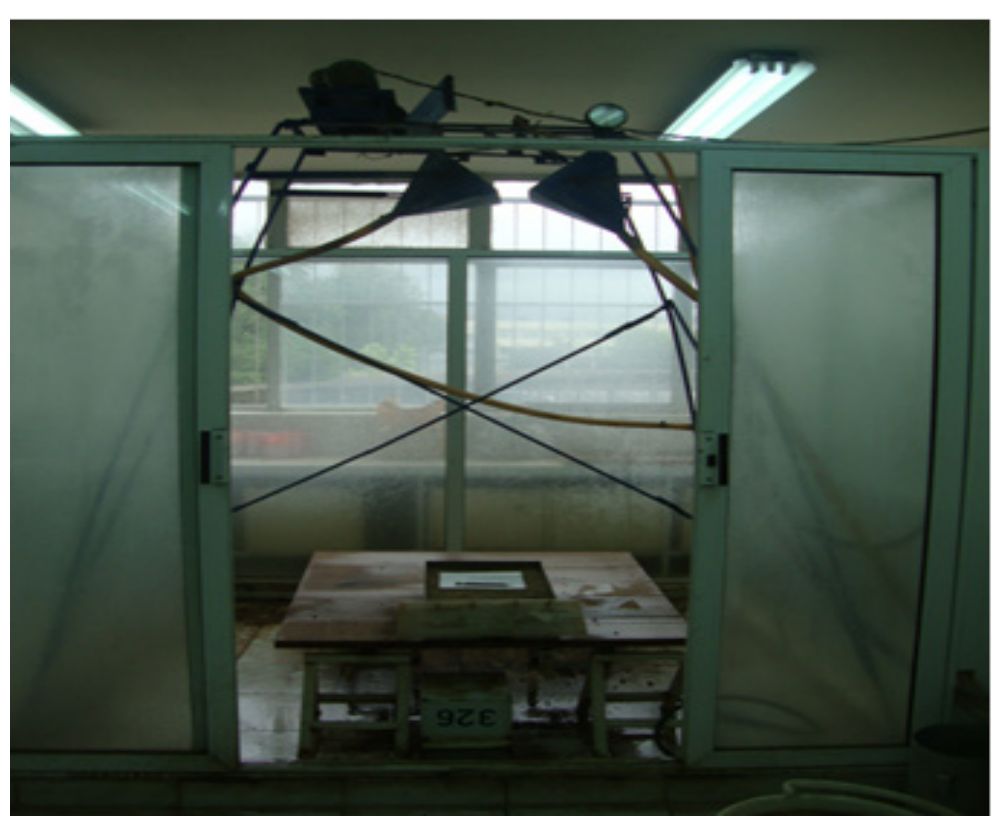
Figure 1. Laboratory type a rainfall simulator. Şekil 1. Laboratuvar tipi bir yağış benzetici.

Some physical and chemical properties of the soil sample used in the study are given in Table 1.