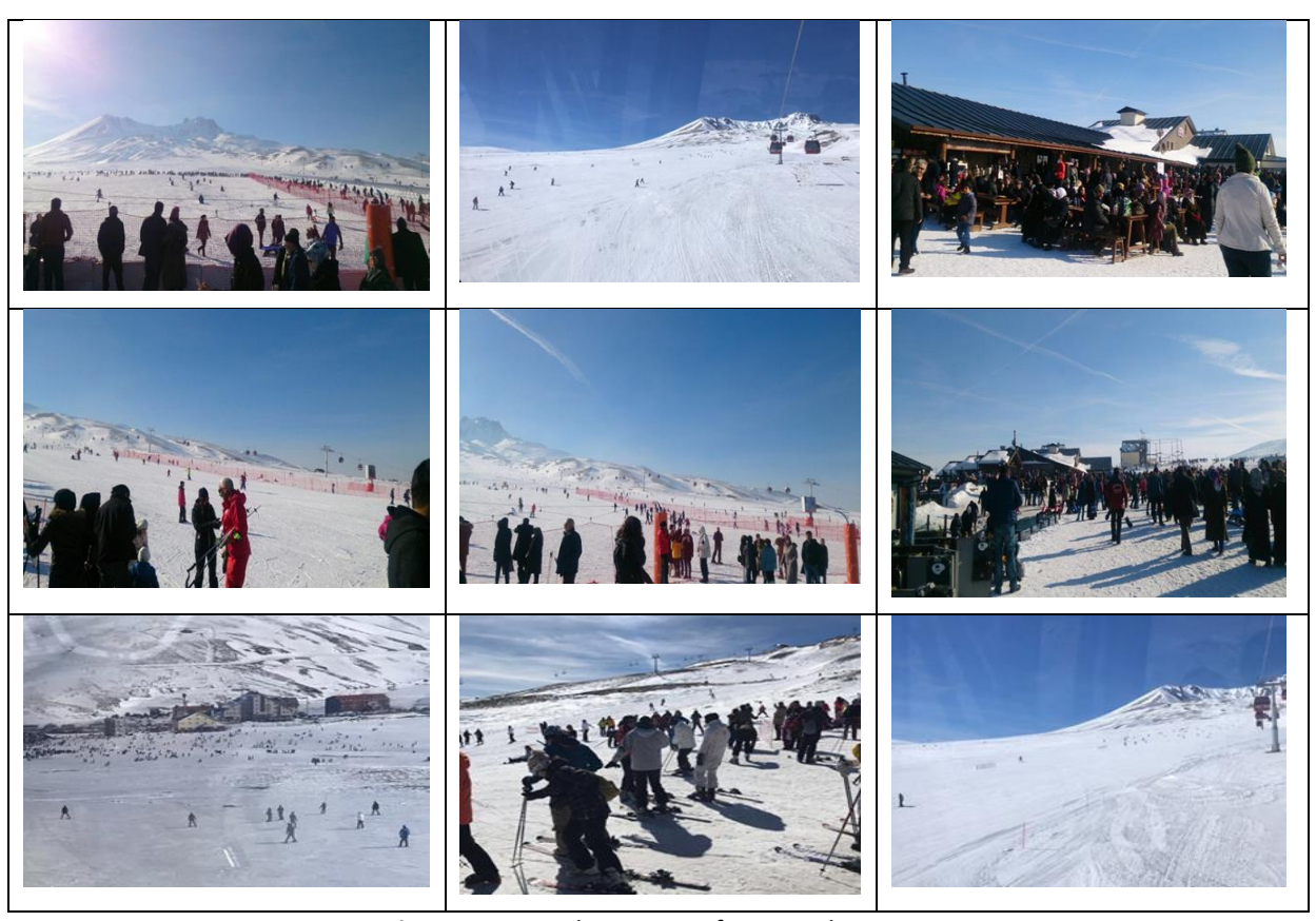
Figure 2. General overview of Erciyes Ski Center