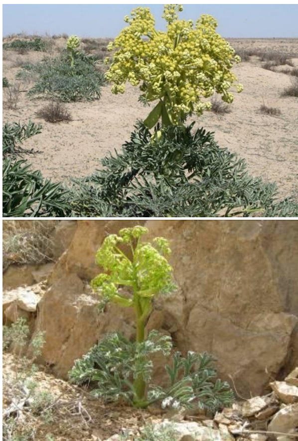
Figure 2. Shrub of Ferula assa-foetida .