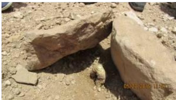
Figure 6. Fencing of stones around these selected shrubs.

C) Harvesting its gum - the final stage for producing dried gum for supplying to the market- in June, July and August. In this stage in each 4-5 days of these months, native medicinal plant collectors with their traditional tools create a thin cutting on the stem and after this time period, gathering resin-like gum that oozes from the stem, and then again replicating this process in 12-16 rounds each 4-5 days on the stems of Ferula in these months. Plus gathering its gum, then thin cutting stems of Ferula shrubs by native medicinal plant collectors in above 12-16 rounds will be gathered and dried by them and present as dried cutting stems of Ferula assa-foetida (Keshteh - in endemic Persian language) for supplying to the market and processing by foreign medicinal factories (Figure 4 and Table 3);