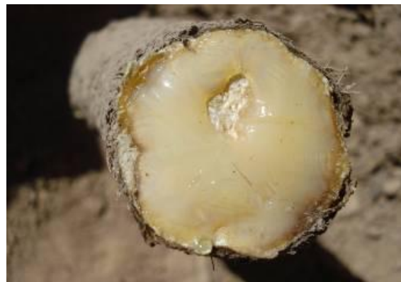
Figure 3. Juice of Ferula assa-foetida .

antibacterial activity of essential oils from commonly consumed herbs, such as Citrus aurantium , C. lemon , Lavandula angustifolia , Matricaria chamomilla , Mentha piperita , M. spica , Ocimum basilicum , Origanum vulgare , Thymus vulgaris , Salvia officinalis and Zataria multiflora and their main components have been evaluated in many countries (Gundamaraju, 2013; Golmohammadi, 2017).