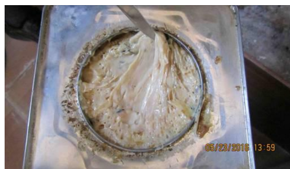
Figure 5. Essential medicinal oil – Oleo Gum Resin (OGR) - of Ferula assa-foetida .

The main constituent of OGR is essential oil which contains ferulic acid, sesquiterpene, sulfur-containing compounds, monoterpenes and other volatile terpenoids. Although advances in chemical and pharmacological evaluation of Ferula assa-foetida have occurred in the recent past, several useful features of this plant remains unknown (Kavoosi and Rowshan, 2013). Accordingly, essential oils obtained from Ferula assa-foetida OGRs in different collections had different chemical composition,