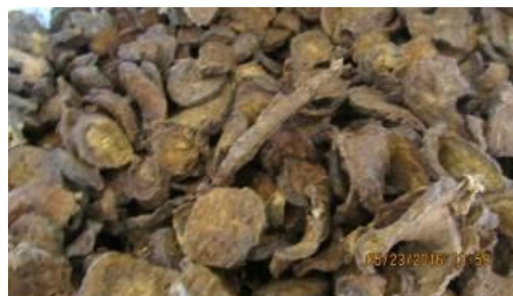
Figure 4. Final production of dried thin cutting stems of Ferula assa-foetida .