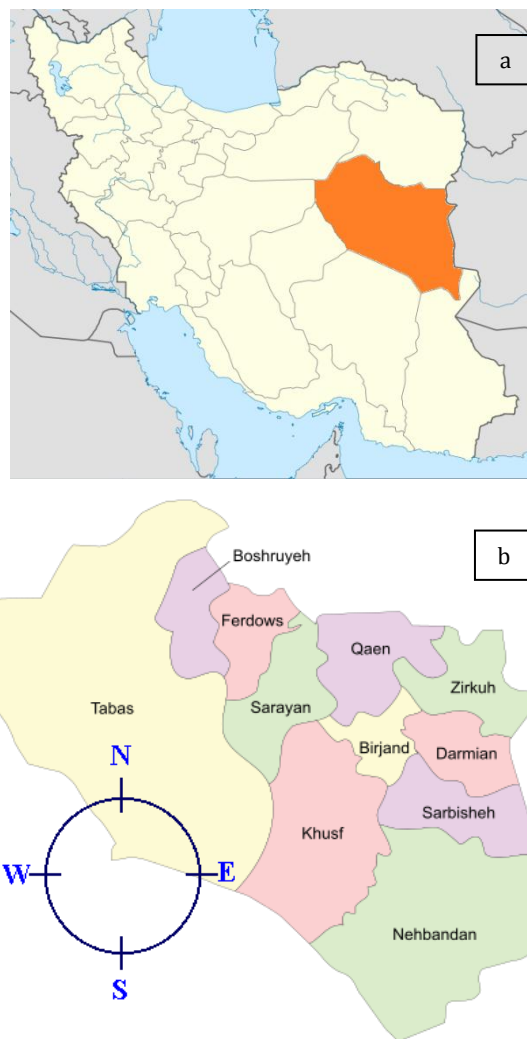
Figure 1. Map of the South Khorasan province in east of Iran. 2a. Map of the main location of doing this research, and beside borders of Afghanistan. Coordinates: 32.8653°N 59.2164°E); 2b. Map of the cities of South Khorasan province, (At a map scale of 1:1000000), (Source: Information and Statistical Department, 2016).

Tabas, Qaen, Nehbandan, Darmian, Sarbisheh, Boshruyeh, Sarayan, Zirkouh and Khusf. Two main regions that in their mountains and pastures Ferula assa-foetida L. has been grown, are Tabas and Darmian counties, thus majority of author field research has been done in these locations (Figure 1).