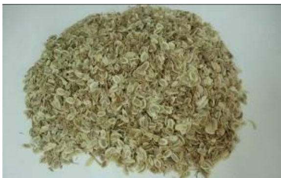
Figure 7. Gathering seeds of Ferula assa-foetida .