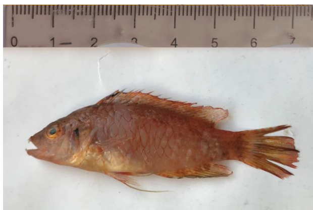
Figure 2: A male specimen of Pteragogus trispilus , 66.5 mm TL, from Iskenderun Bay (MSM-PIS/2018-3)