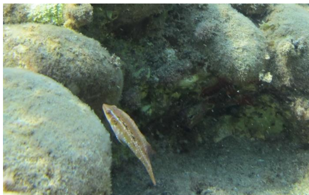
Figure 1: Underwater observation of Pteragogus trispilus in Konacık (Arsuz), Iskenderun Bay

digital caliper and weighed to the nearest gram (g). The specimen is deposited in the Museum of the Faculty of Marine Sciences and Technology, Iskenderun Technical University with catalogue number MSM-PIS/2018-3. Distribution of the P. trispilus in the Red Sea and the Mediterranean Sea has given according to previous capture records and the present report from Iskenderun Bay (Fig. 3).