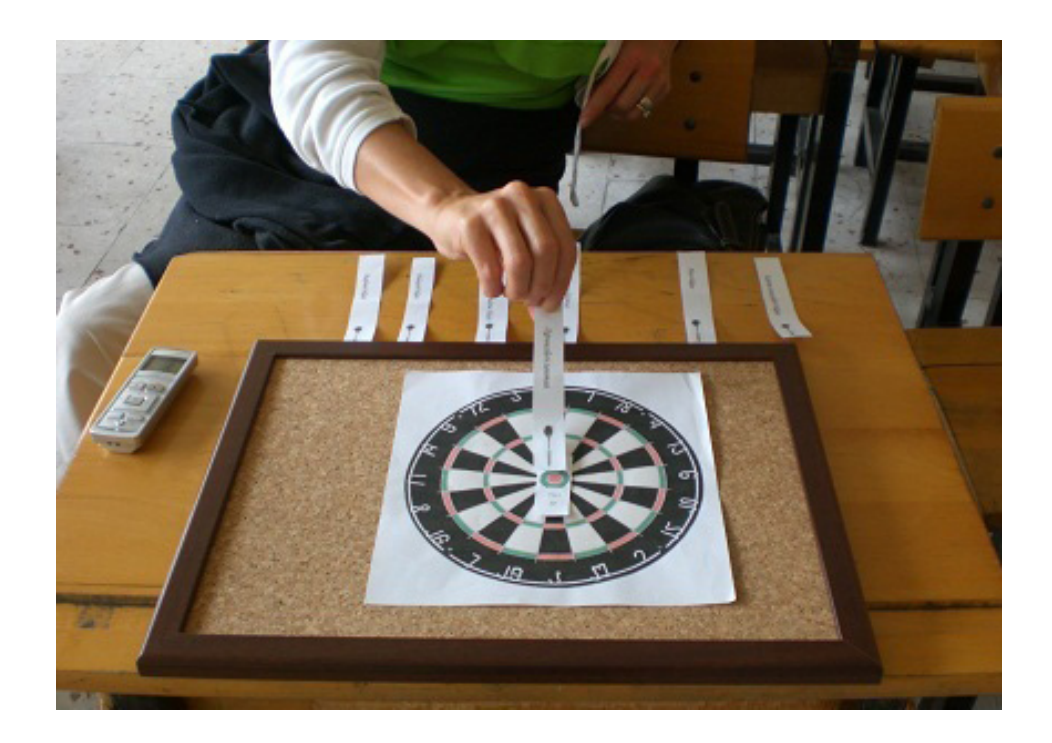
Fig. 6 A snapshot from the Free Throw game activity when a teacher is trying to hit the misconception she has identified by the professional competency she has chosen in order to eradicate the misconception