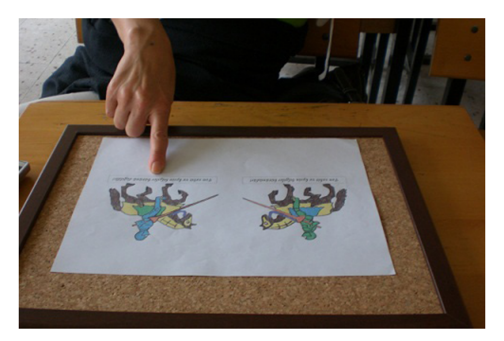
Fig. 3 A snapshot of the moment that a teacher was making an explanation regarding the warrior that she supported in the Warriors game activity

warrior were organized in opposition to the discourses of the blue warrior. The warriors and the discourses supported by the warriors in three rounds are given in Table 2. At first, the teachers were expected to take the side of the warrior that they supported and then they were asked which warrior's side the curriculum takes. As a result, the teachers provided information especially on how they perceived Scientific Knowledge, The Principle of 'Little but Essential Knowledge' and constructivism and they questioned the internal consistency of the curriculum concerning these.