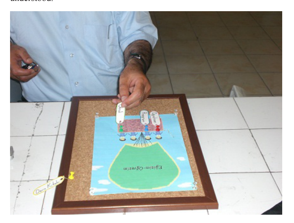
Fig. 2 A snapshot from a teacher's way of saving the balloon by throwing the weight symbolizing the school in the Education Balloon game activity

According to the scenario where the education balloon was falling down, the teachers had to 'save' the balloon by throwing 4 weights symbolizing the school, curriculum, teacher and textbook one by one (see Figure 2). The teachers were provided with an environment where they were expected to make a priority order among the school, curriculum, teacher and textbook. By this way, how these teachers perceived the relationship among the concepts above, how much and for what they needed the curriculum and how they perceived the role of the teacher in education and teaching were understood