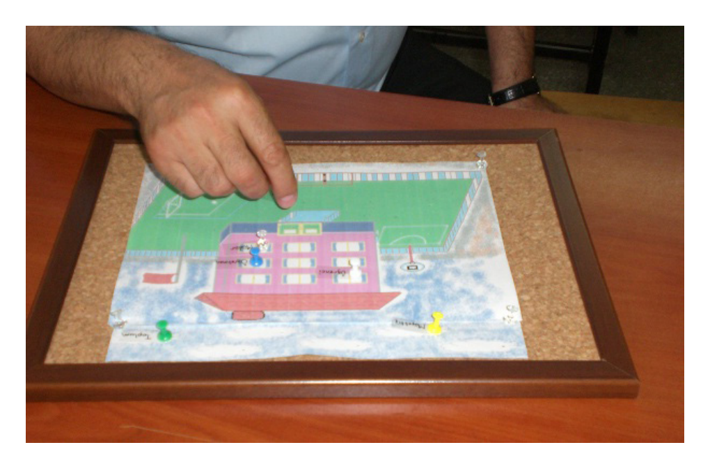
Fig. 1 A snapshot from a teacher's placement in the School Alive game activity

The teachers were asked to place the slips symbolizing the parent, student, school principal, inspector, teacher and society onto the school layout (see Figure 1). After that, the slip symbolizing the teacher was removed from the picture and the teachers were asked to put other slips to fill up the space of the teacher. Lastly, the teachers were asked to place all the slips again according to the curriculum. As a result, both the teachers' perceptions of parents, student, school principal, inspector, teacher and society and their perceptions of the references in the curriculum regarding the interrelationships among these, and thus the correspondence level of their perceptions with the curriculum were understood.