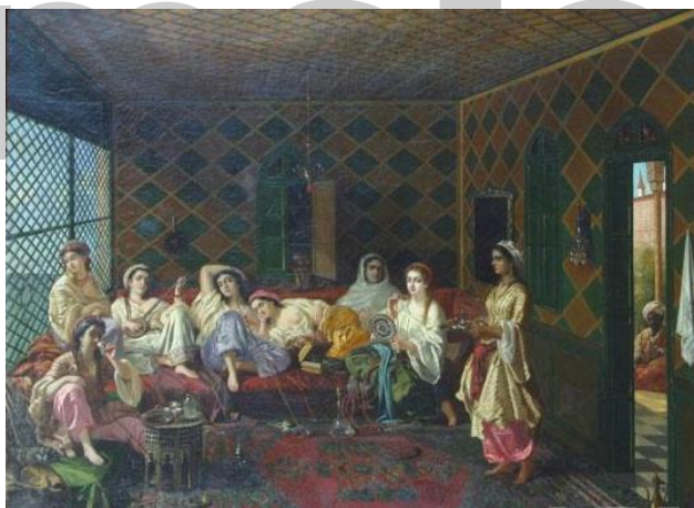
Theodor Aman, Turkish interior

Abu Hasan is the son of a rich merchant in Baghdad, who divides his inherited capital into two equal parts; one of the halves is rapidly exhausted in luxurious parties with phony friends and the other half is safely kept to allow him a decent existence for his entire life. Thus Abu Hasan illustrates both the wise and the reckless versions of the Oriental identity. After abandoning his former friends he takes to inviting a total stranger for dinner every evening. But one evening his unknown guest is the mighty caliph of Baghdad, Harun-al-Rashid, who was traveling disguised as a merchant. Asked by his guest about his most secret wishes, he expresses his desire himself to be the caliph of Baghdad for one day, a wish easily made possible by Harun-al-Rashid. Invested with both wisdom and the supreme power, Abu Hasan proves to be a good caliph, but also gives Caragiale a pretext to describe the luxury and leisure of the Oriental court.