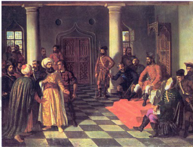
Teodor Aman, Vlad the Impeller and the Turkish Envoys

The same mechanism is recognizable when the Romanian poet, author of numerous historic legends, versifies various battles between his country's army and the Ottoman one. Even if he always courteously describes the military force "the enemy", he also celebrates the Romanian victories on the battlefields. Another typical conflicting situation is to be found in the poems describing the visits of the Turkish envoys in Walachia. While Mircea the Eldest, although he is ready to go to war to defend the independence of his country, asks his captains to "respect" the envoys (in Mircea the Great and the Envoys; Mircea cel Mare și solii ), Vlad the Impeller defies the empire by afflicting its emissaries. The Impeller and the Envoys (Țepeș și solii) versifies a well-known historic episode, which tells the story of the messengers of Mahomet II, who came to dethrone Vlad, also sustained by the local treacherous boyars. But Vlad invokes his repeated fights for maintaining the suzerainty of Walachia and he is consequently acclaimed by the people. In a very cruel response to the request of the Ottoman Empire to abdicate, he drives nails into the heads of the envoys, as they had refused to take off their turbans, thus disobeying the local stately protocol.