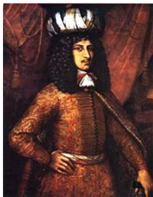
Dimitrie Cantemir in Ottoman dress, unknow artist