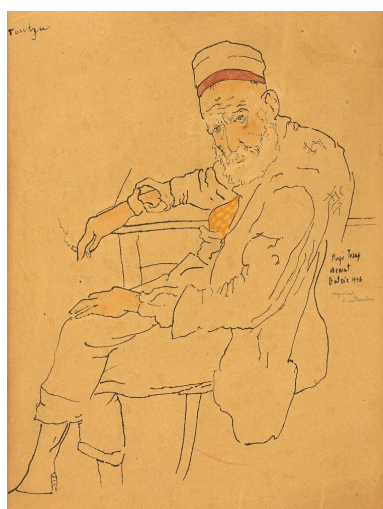
Nicolae Tonitza, Hagi Yusuf Memet

It is a kingdom where ethical and moral values are dissolved and the frenzy music and dance of the harem ravages the entire cosmos: “Out of cauldrons wrests a tune, / Odalisques o’erflow the moon”, a truly original version of Paradise: “Hissarlik, the love pursued / Like a vilayet’s white hues / Once by lime and plague o’ergrown, / Nest of veg’table and stone, / Stay the Eden I have known!” The only “philosophy” allowed here is the faultless wisdom of Khodja Nasr-ed-Din, which can fuddle you like a good, old wine: “One wine makes you drink a bit: / Khodja Nasr-ed-Din’s own wit”. The critic Marin Mincu noticed the monadic self-sufficiency of Khodja Nasr-ed-Din, who refuses the honors offered by the exterior world, and finally consumes himself in autophagy (a radical form of anthropophagy). (Mincu, 131-32) So perfection is perilous and self-destructive, and only poetry can save it from becoming extinct.