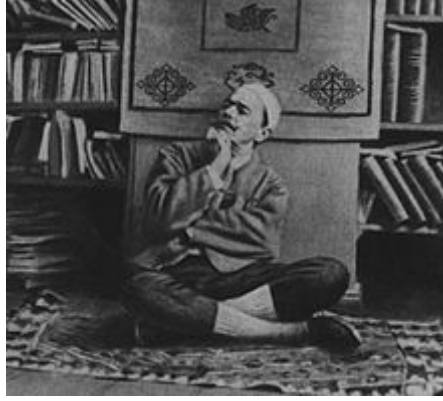
I.L. Caragiale in Oriental costume

authors and translators, as well as founders and managers of one of the first theatrical schools in Romania. The young I.L. Caragiale was one of the first students of this school, and he later on worked for the National Theatre of Bucharest himself, first as a prompter, then as a translator and author of original plays, and finally, he became the director of the theater.