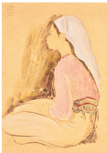
Nicolae Tonitza, Little Tartar girl

At the beginning of the twentieth century, and mainly in the interwar period, the fascination of the Turkish world is still active in Romanian culture. The best example to illustrate it is the poet Ion Barbu (1895-1961), Dan Barbilian by his real name, also a famous professor of mathematics at the University of Bucharest. His cycle Hissarlik is an exercise of pure admiration for the Turkish world, intended “for a fairer worship of Anton Pann’s world”, himself a well-established poet and musician of the nineteenth century (1796-1854), who mainly treasured the Balkan-Oriental values and folk traditions.