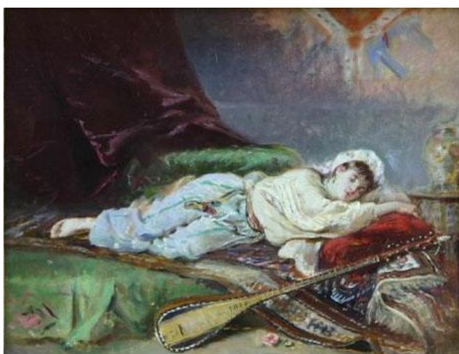
Theodor Aman, Odalisque sitting

The next cultural generation reveals different visions and attitudes, but conserves the mixed feelings towards the Oriental world. Mihai Eminescu, the most important Romanian poet of all times, has magnificently illustrated the gap between the sympathetic cultural awareness and the patriotic romantic perception, in his Third Letter ( Scrisoarea III ), a very well-known poem studied in high school textbooks. He