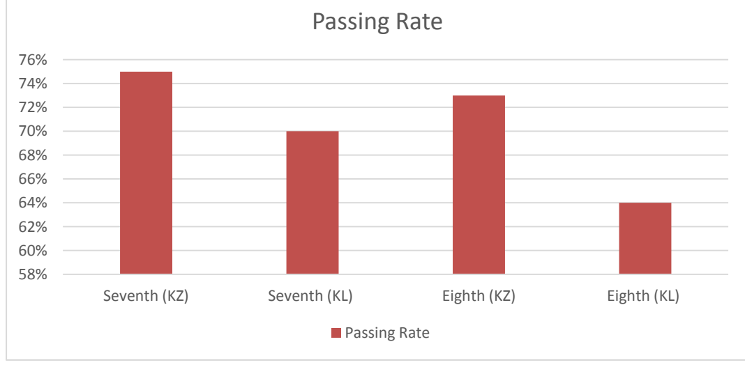
Figure 2: Student's passing rate for CPL sessions

According to this study, the passing rate in both schools for both grades recorded high rates of understanding and student's showed motivation and enthusiasms for learning CPLs. As shown in Figure 2, there are no significant differences in the passing rate for seventh grade between the two basic schools. However, a difference in the Eighth grade was observed between both schools.