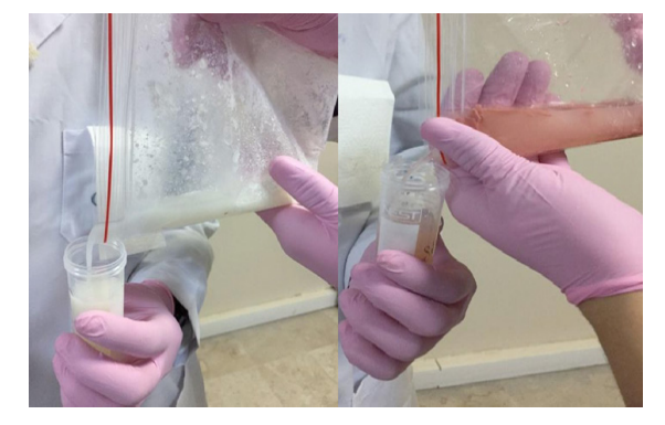
Figure 1. Homogenization step of bacteria isolated from salami and cheese samples.

The bacteria were isolated that 25 g salami and cheese samples in expiration date past. The samples were homogenized in 225 mL buffered peptone water for pre-enrichment of bacteria. For the homogenization step, all samples were placed in a sterile polyethylene bag and it was shown in Figure 1. The samples were shaken for 2 minutes in Stomacher (Stomacher 400). 1.5 \times 10^8 CFU/mL (McFarland No: 0.5) bacterial suspensions were prepared in sterile distilled water and then a series of dilutions ( 10^8 , 10^7 , 10^6 , 10^5 CFU/mL) were prepared to determine the number of bacteria. 100 µL of each dilution series were inoculated to Nutrient Agar (Oxoid). Each Petri dish was allowed to incubate at 37 °C. At the end of the period, bacterial colony counts were made.