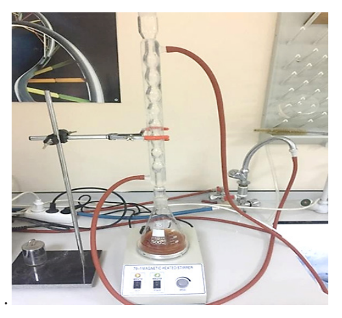
Figure 2. The evaporator used to obtain extract of P. granatum shell.