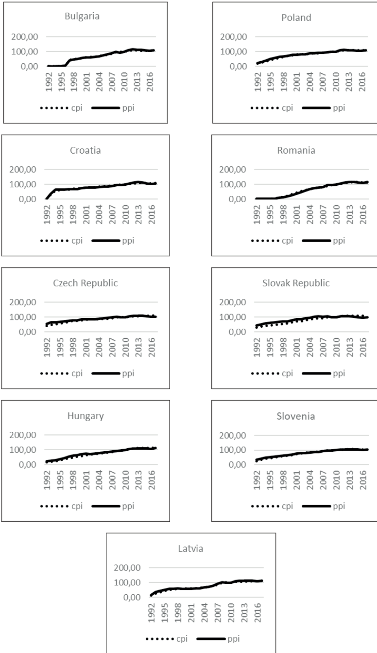
Figure 2. PPI and CPI for Selected CEECs