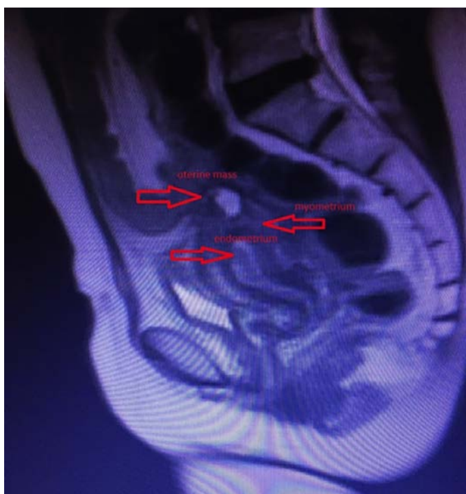
Figure 1. Magnetic resonance image of Uterine mass. Arrows shows uterine mass; endometrium and myometrium.

On postoperative period, hemoglobin and hematocrit levels began to drop, in spite of blood transfusion. On the first day, hemoglobin was 8.9 g/L, transfusion with 2 units of erithrocyte suspension was made. However, there were no increase on levels, on the contrary, until pos-operative day 18, hemoglobin levels continued to drop with the last value being 7.6 g/L. Transvaginal ultrasonography and computed tomography (CT) scan were performed. They showed a loculated, hyperdense lesion on operation site, sized 7.5×5 cm thought to be an abscess or hematoma. CT scan also showed a hyperreactive lymph node sized 2.7×1.5 cm on right inguinal region. Ongoing ampicillin therapy was changed to piperacillin-tazobactam 4.5 g per three times a day. In the meantime, pathology report of operation specimen was completed and result came as malignant. A plasmablastic neoplasm showing lambda light chain monotype was localized diffusely on serosal surfaces of the uterus, paracervical and parametrial tissues, external surface and muscular layer of both fallopian tubes, omentum was detected. On microscopic examination, morphologically plasmablastic, multinuclear with large, pleomorphic