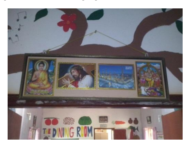
Figure 2: Symbolic representations of the four major religions practiced by the majority of the Sri Lankans have been displayed above the entrance to the dining room.

It does represent the four major religions practiced in Sri Lanka and symbolizes religious harmony (Fig. 2). The other 26 homes that I visited during fieldwork also had religious observing spaces. In contrast, they were all confined to the major religion for which the children's home was originally intended. Some children who were raised under a different religion before coming into these homes had to observe the prevailing religion in the homes or to refrain from observing their personal religious beliefs. Lababidy (1996, p. 6) regrets such situations and states "Unfortunately, many children's programs in developed and developing countries are still designed with little thought to cultural or religious diversity even though the importance of culture is highlighted in articles within the Convention".