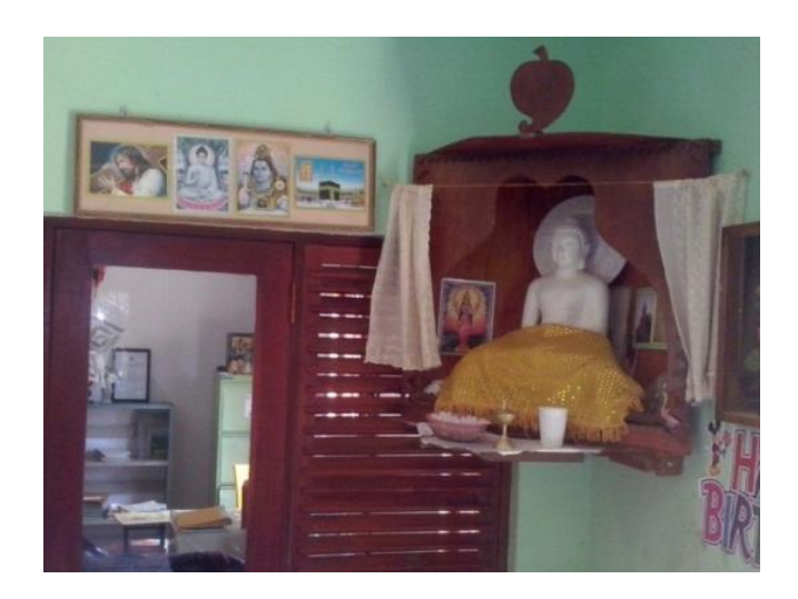
Figure 1: The religious observance space represents all the four major religion beliefs in Sri Lanka (source: PAR 2012)