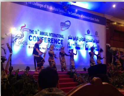
Authors photos taken in Balikpapan, December, 2014.