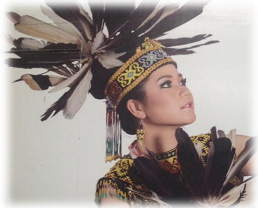
Author's photos taken in Balikpapan, December, 2014.