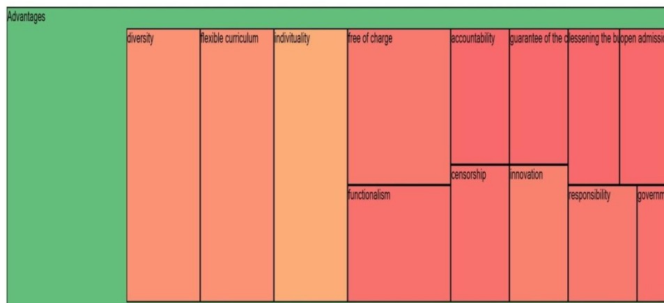
Figure 2: The Prominent items about the advantages of Charter Schools

Individuality, innovation, flexible curriculum, censorship, diversity, free of charge, accountability, responsibility, functionalism, open admission, government assistance, lessening the burden of government and guarantee of the contract are the advantages of Charter schools specified by participants. The following figure shows which items are used more often: