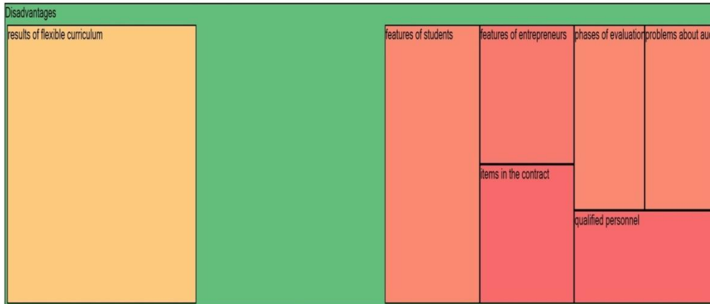
Figure 4: The Prominent items about the disadvantages of Charter Schools

disadvantages of Charter schools. The following figure shows which items are used more often: