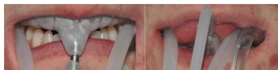
Figure 3. Positioning of custom trays for both archs.