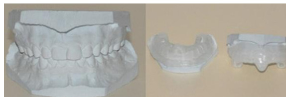
Figure 2. Custom trays and cast models.