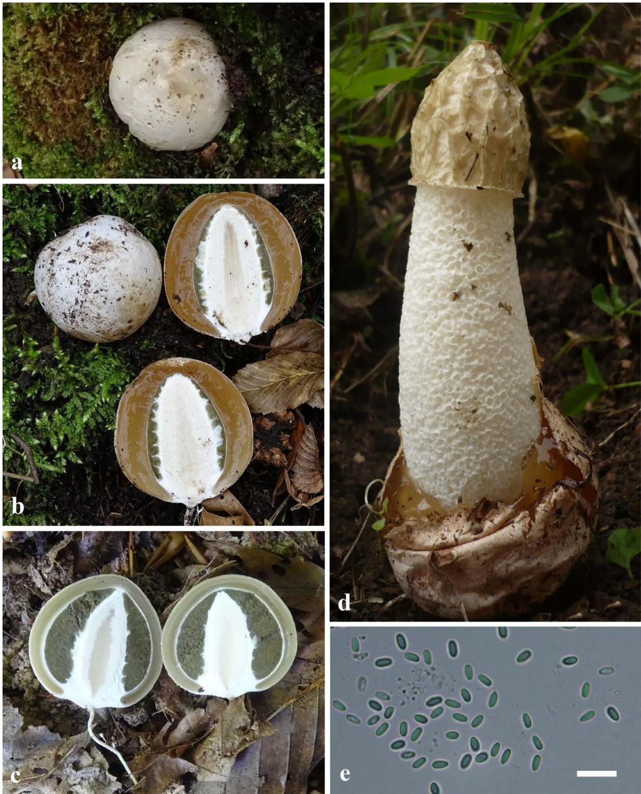
Figure 3. Basidiocarps (a-d) and basidiospores (e) of Phallus impudicus (bar 10 \mu ).

Pseudocolus fusiformis was reported previously from only one locality in Trabzon (Akata ve Doğan, 2011).