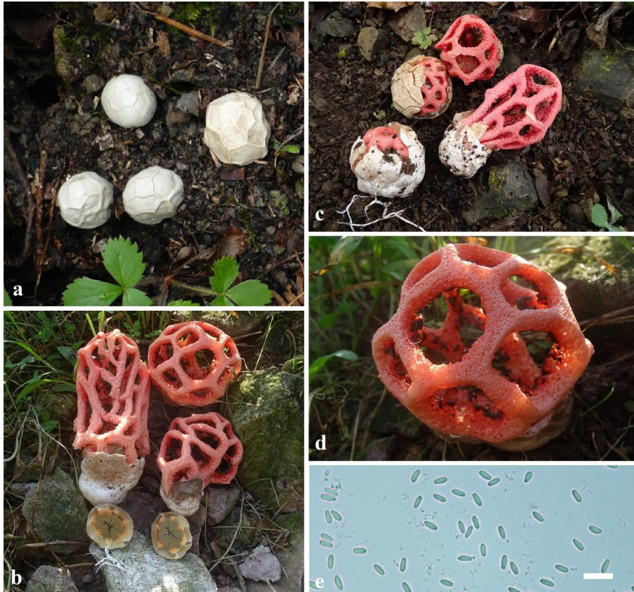
Figure 1. Basidiocarps (a-d) and basidiospores (e) of Clathrus ruber (bar 10 μ).

Mutinus caninus (Huds.) Fr., Summa veg. Scand., Sectio Post. (Stockholm): 434 (1849).