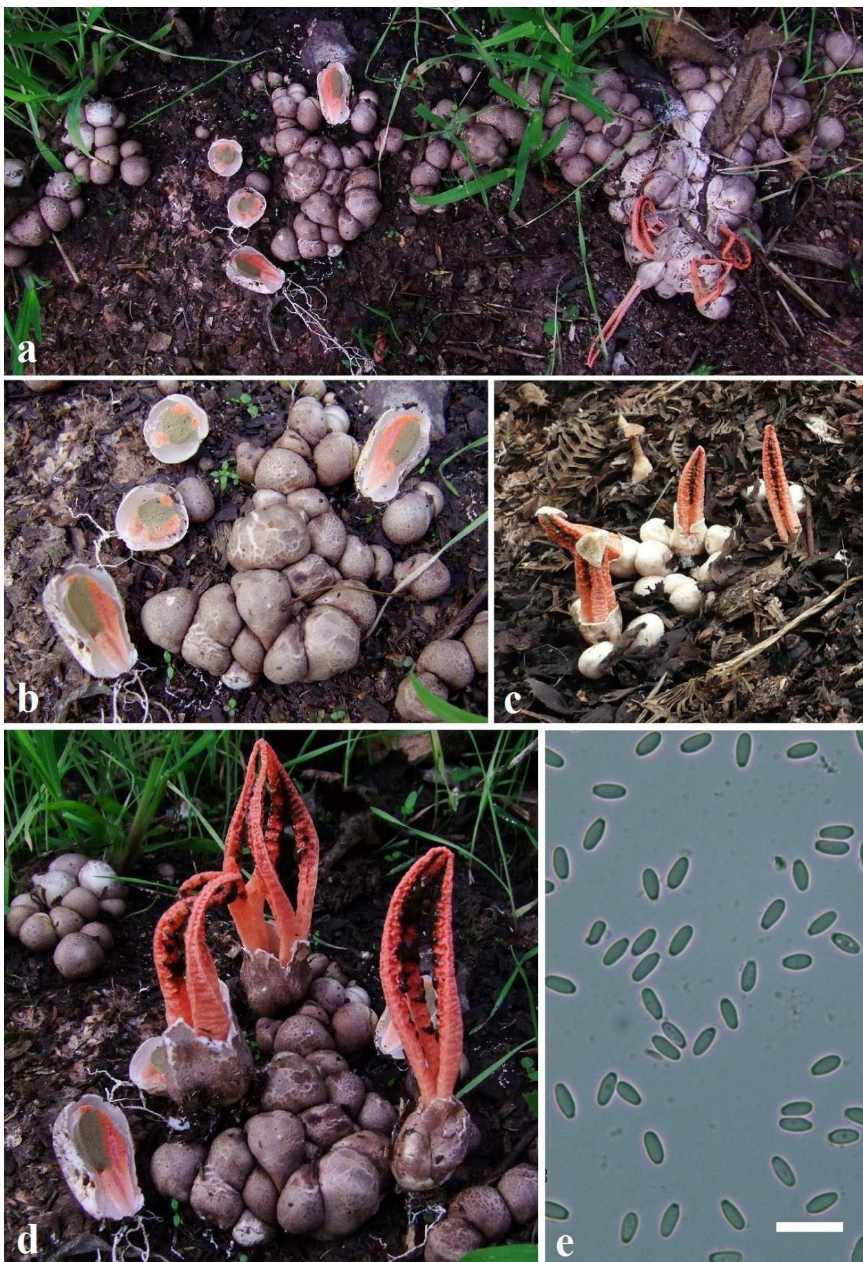
Figure 4. Basidiocarps (a-d) and basidiospores (e) of Pseudocolus fusiformis (bar 10 \mu ).