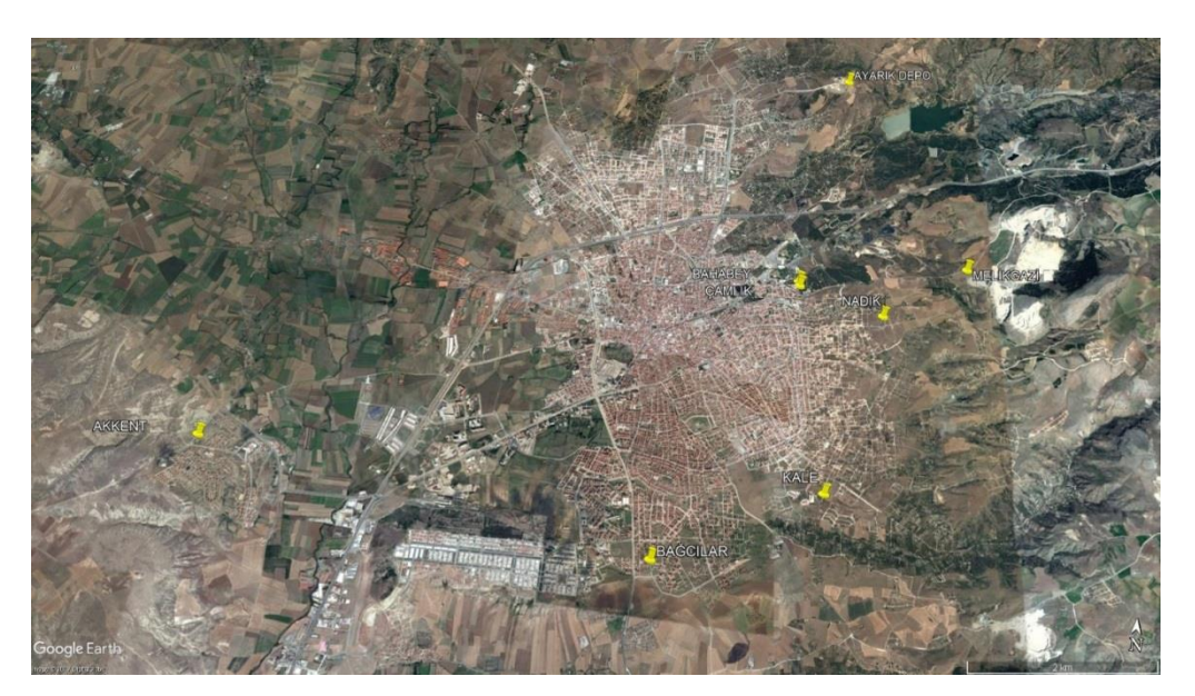
Figure 2. Tanks in Çorum that were controlled daily.

108 samples were gathered between the environmental health staff of Çorum provincial Health Directorate between January-July by within the program jointly determined. Microbiological parametric values in the "Regulation on Waters for Human Consumption" number/250 mL for E. coli , Coliform, Enterococci and number/50 mL for C. perfringens are taken into consideration (Table 2).