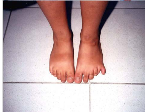
Figure 2: Extra digit on the patient's left foot.

Moon, and was consequently referred to as Laurence- Moon-Biedl syndrome. BBS is distinguished from the much rarer Laurence-Moon syndrome, in which retinal pigmentary degeneration, mental retardation and hypogonadism occur in conjunction with progressive spastic paraparesis and distal muscle weakness, but without polydactyly (4,5).