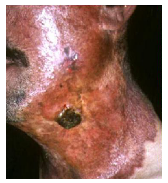
Figure 1. Erythematous, well-defined plaque over the left malar area and the left neck, and exophytic, ulcerated tumoral lesion on the middle plaque

Dermatological examination revealed an erythematous, nontender, well-defined plaque of 30x40 cm in size over the left malar area and the left neck. An exophytic, infiltrated and ulcerated tumoral lesion of brownish-red, 3x4 cm in size was observed on the center of the plaque (Fig. 1). Diascopic examination gave an apple-jelly appearance. The systemic examination was normal. He was afebrile, and there was no submandibular or cervical lymphadenopathy. No BCG scar was visible.