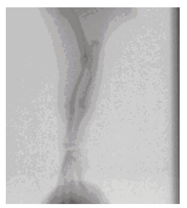
Figure 5: EPO 3.week radiography.