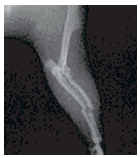
Figure 1: Fracture was corrected radiologically.

angiogenesis and tethered to accelerate wound healing. It plays a role in wound healing by its' proangiogenic effects (4).