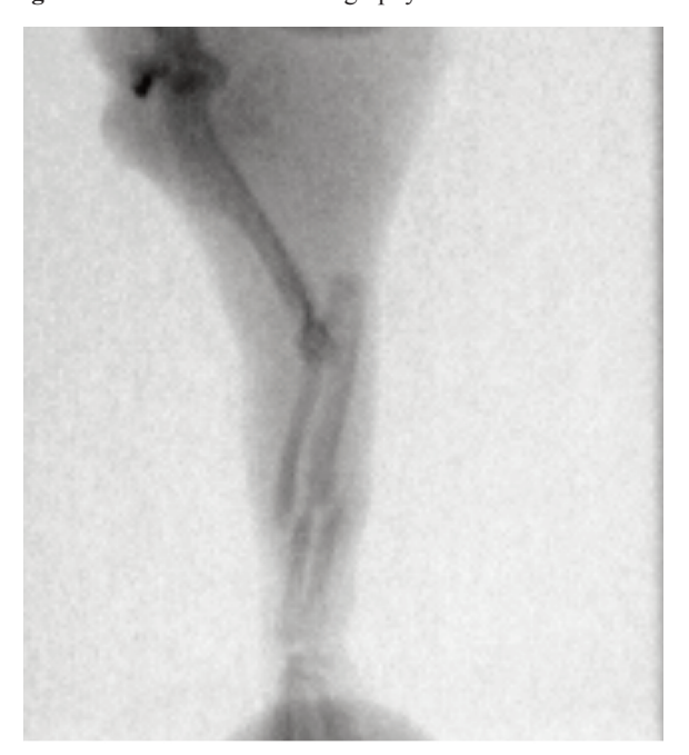
Figure 6: Control 3.week radiography.

The exact mechanism of hypoxia-induced erythropoietin production has not been resolved yet. The oxygen receptors in or around the cells were supposed to be the main responsible mechanism. EPO receptors were found in brain, overs, tubas and testicular tissues (11). Erythropoietin production is possibly related not only with the hormonal system, but also involves paracrine and otocrine systems. EPO was successfully used in experimental myocardial infarction (12), necrotisane enterocolitis