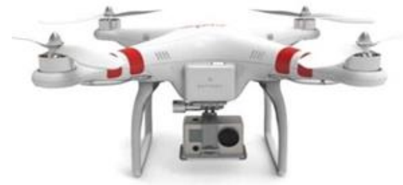
Figure 4.1 Air platform

A mini helicopter with rotary wing and quad rotor was used as the air platform. The model used had appropriate place/space for the installation of electric and electronic (avionic) systems and camcorder systems, such as camcorder, video transmitter and standard radio transmitter. Figure 4.1 shows the UAV used as the air platform.