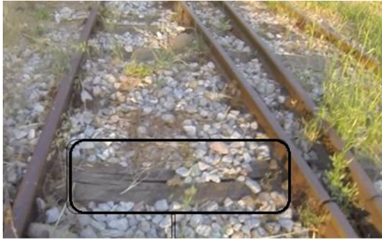
Figure 4.4. The surface crust formed in the rail