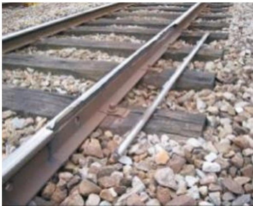
Figure 4.2. Cracks may occur on the switch