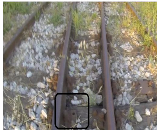
Figure 4.3. Control of rail fasteners