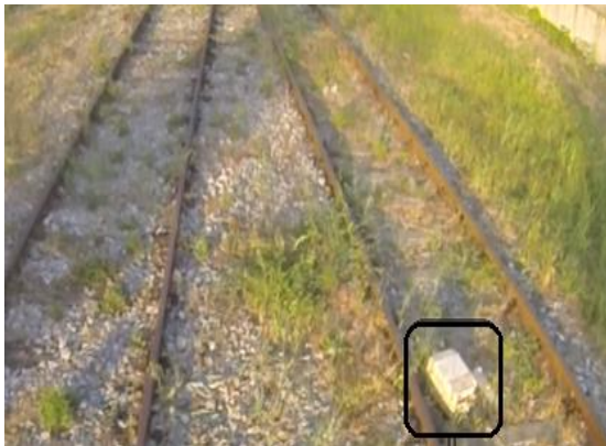
Figure 4.6. The status of Traverse