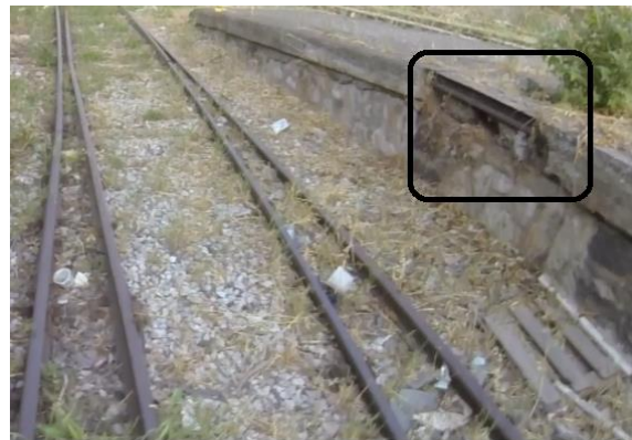
Figure 4.7. Control of switches